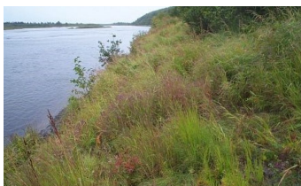
Bluejoint grass/field horsetail-western touch-me-not meadow