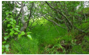
Kenai birch-paper birch/Sitka alder-cloudberry/bluejoint grass/horsetails/moss forest

Natural succession: Normal time and growth without disruptive erosion. As the effect of the landslides or windthrow subsides, deciduous trees will colonize and reproduce and eventually replace alder as the dominant overstory species. The understory typically will open, allowing for a mix of competitive, commonly hydrophilic shrubs, forbs, and graminoids to colonize and thrive. The period needed for this transition currently is unknown, but it likely depends partially on the rates of colonization and growth of trees. This transition may be slowed temporally and plant colonization may be affected spatially by seepage and runoff.