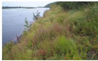
Bluejoint grass/field horsetail-western touch-me-not meadow

Erosion from landslides or windthrow. These steeply sloping escarpments may be susceptible to landslides, and the medium and tall trees may be susceptible to windthrow. These disturbances can create nonvegetated areas in which fast-growing, pioneer plants may become established. The erosional processes may be induced or further compounded by the wetness of the soils. The time frame for these disturbances is unknown, but windthrow generally depends on a variety of factors, including tree height, rooting depth, and windspeed.