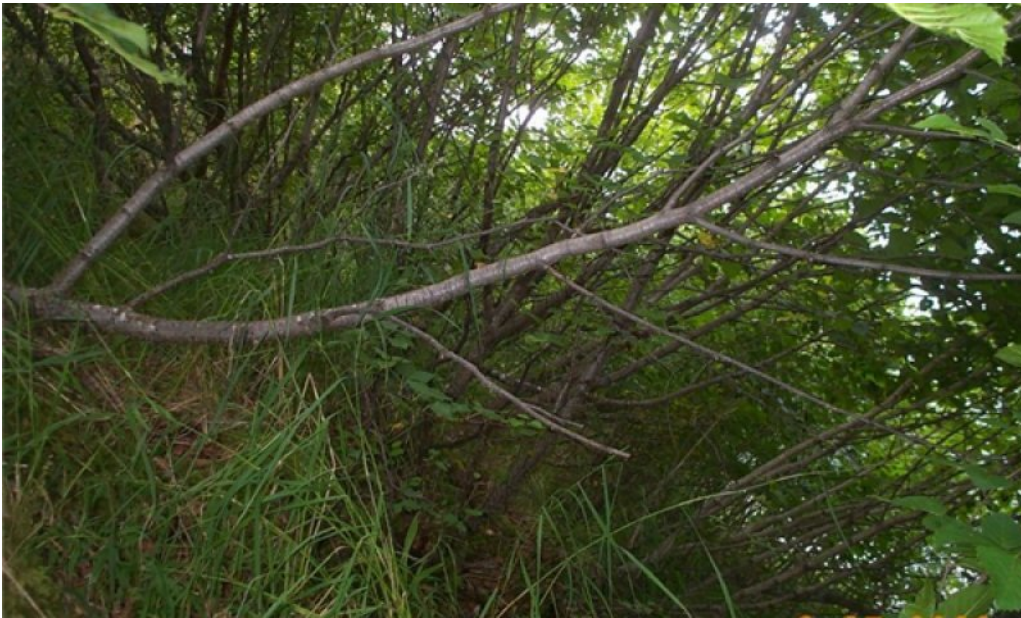
Figure 4. Typical area of community 1.2.