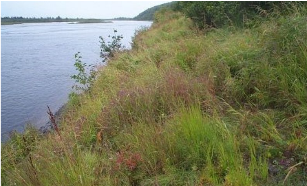
Figure 6. Typical area of community 1.3.