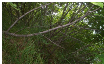
Sitka alder/bluejoint grass/field horsetail scrubland