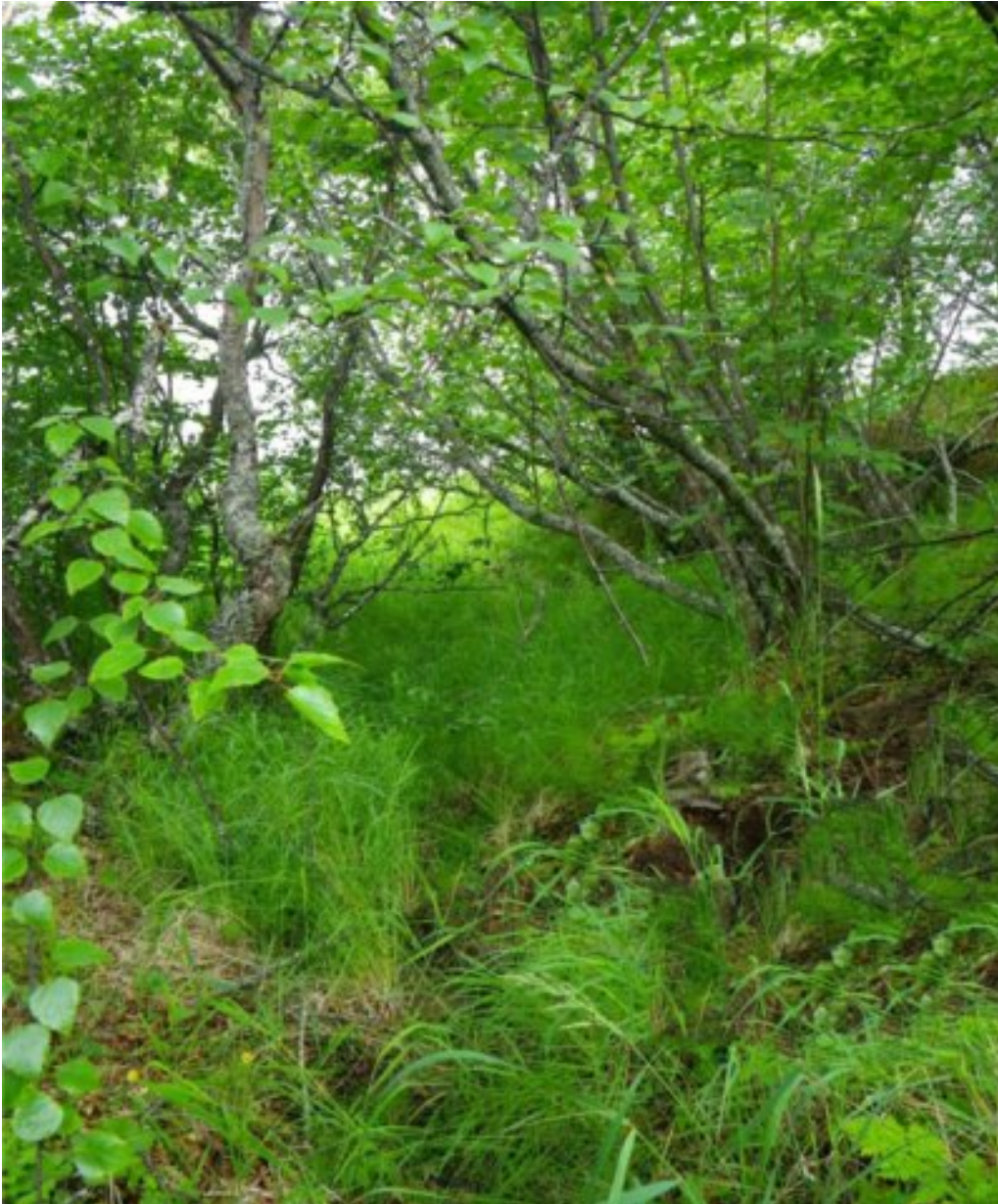
Figure 2. Typical area of community 1.1.

Kenai birch-paper birch/Sitka alder-cloudberry/bluejoint grass/horsetails/moss forest