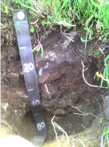
Figure 9. A typical soil profile for this site. The soil is dry, gravelly, and bedrock controlled. This photograph was taken in proximity to Glacier Bay National Park and Preserve.