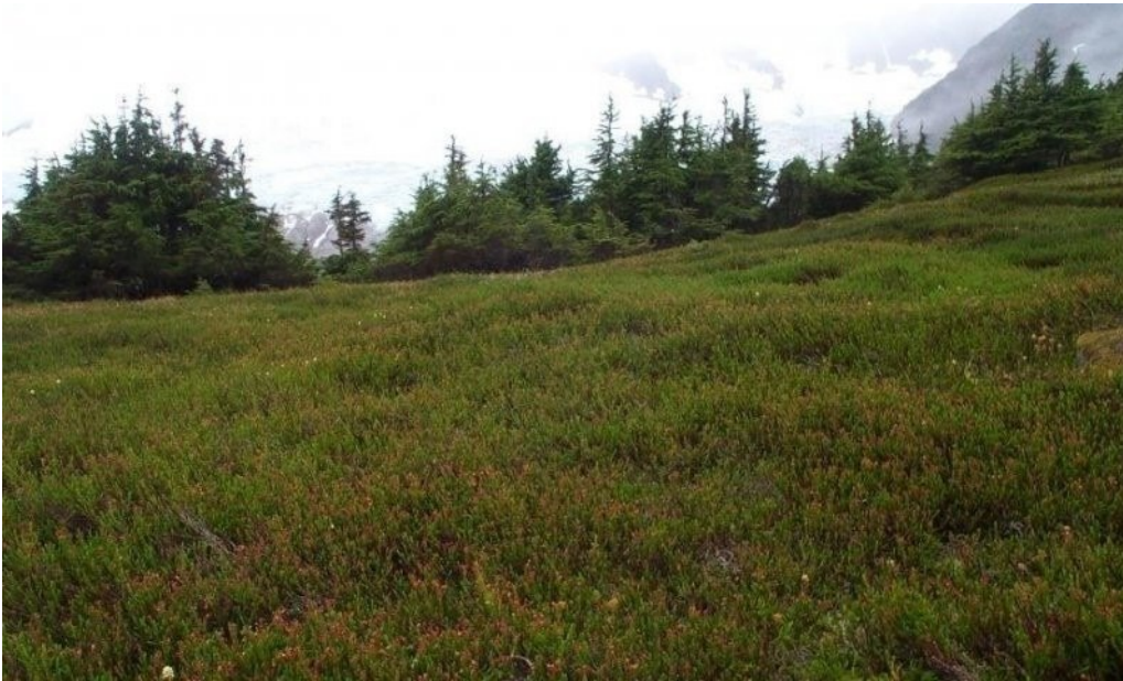
Figure 10. A typical ericaceous dwarf scrub community associated with this site. This photograph was taken in the Skagway-Klondike Gold Rush National Historic Park, Area (Flagstad and Boucher 2015).

The reference plant community is ericaceous dwarf scrub. Exposed bedrock and surface rock fragments are common. Species diversity can be high with a diverse range of shrub, graminoid, and forb species. Common species include black crowberry, western moss heather, yellow mountain heath, Aleutian mountain heath, Alaska bellheather, longawn sedge, boreal sagebrush, clubmoss, Nootka lupine, and star reindeer lichen.