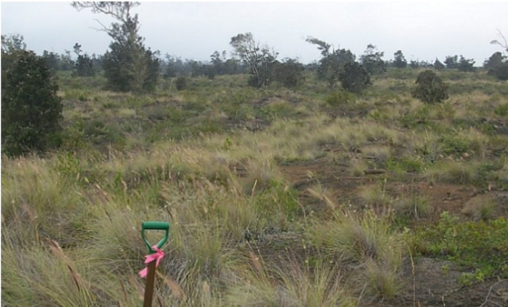
Figure 11. Fountaingrass invaded site. 8/17/05 D Clausnitzer MU466

This community phase is savanna with a sparse to open canopy of trees 25 to 50 feet (8 to 16 meters) tall and a sparse secondary canopy of trees 8 to 20 feet (2.5 to 6 meters) tall. Abundance of native tree species in the secondary canopy may be less than that found in community phase 1.1. The shrub understory has also been diminished in abundance and diversity. Cover and diversity of grass/grasslike species and forbs is higher than in phase 2.1 due to the abundance of introduced species.