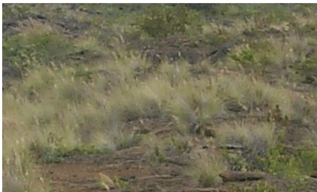
Figure 14. Degraded site. 8/17/05 D Clausnitzer MU466

This community phase is essentially an open grassland with small numbers of trees and shrubs. If fountaingrass is the dominant grass species, it is possible to lose most other species, both native and introduced, due to greatly increased wildfire.