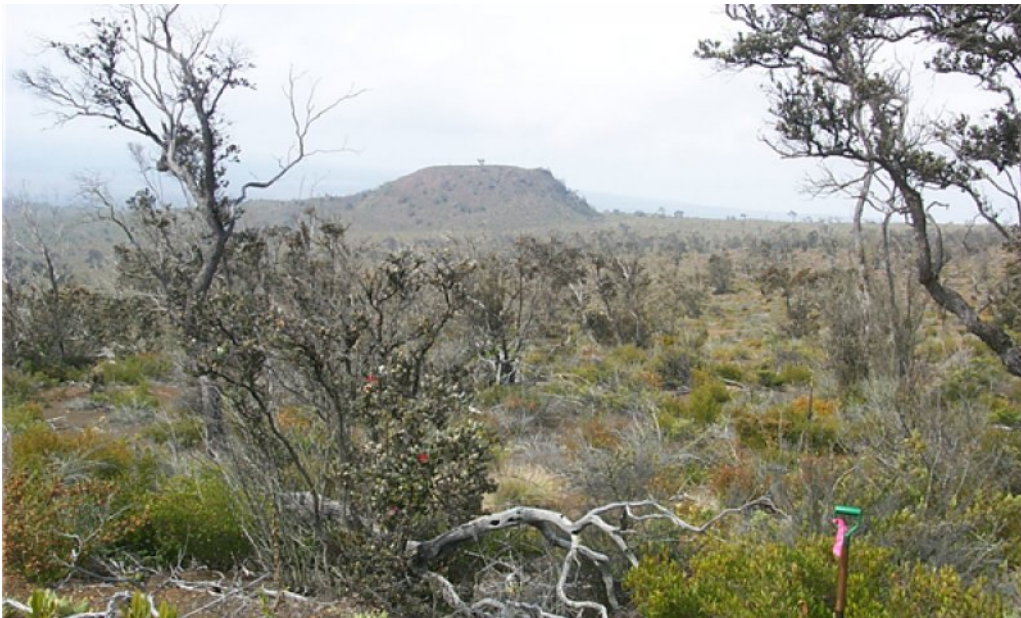
Figure 7. More open site on Ohianui soil. 5/18/05 D Clausnitzer MU470