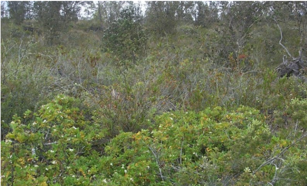
Figure 6. Reference community phase. 5/18/07 D Clausnitzer MU166