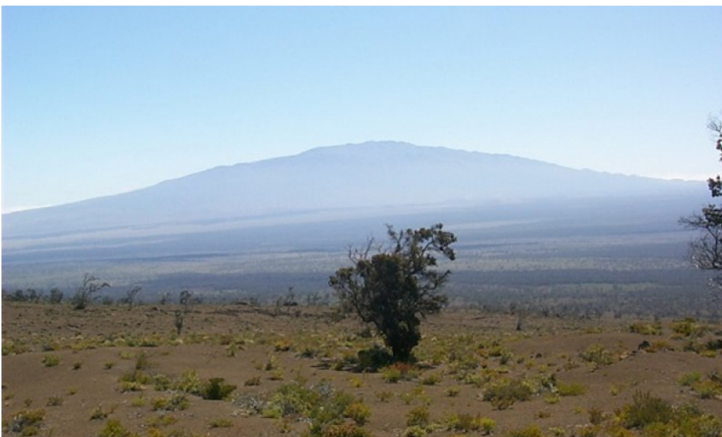
Figure 8. Example of sparse extreme. D Clausnitzer generic