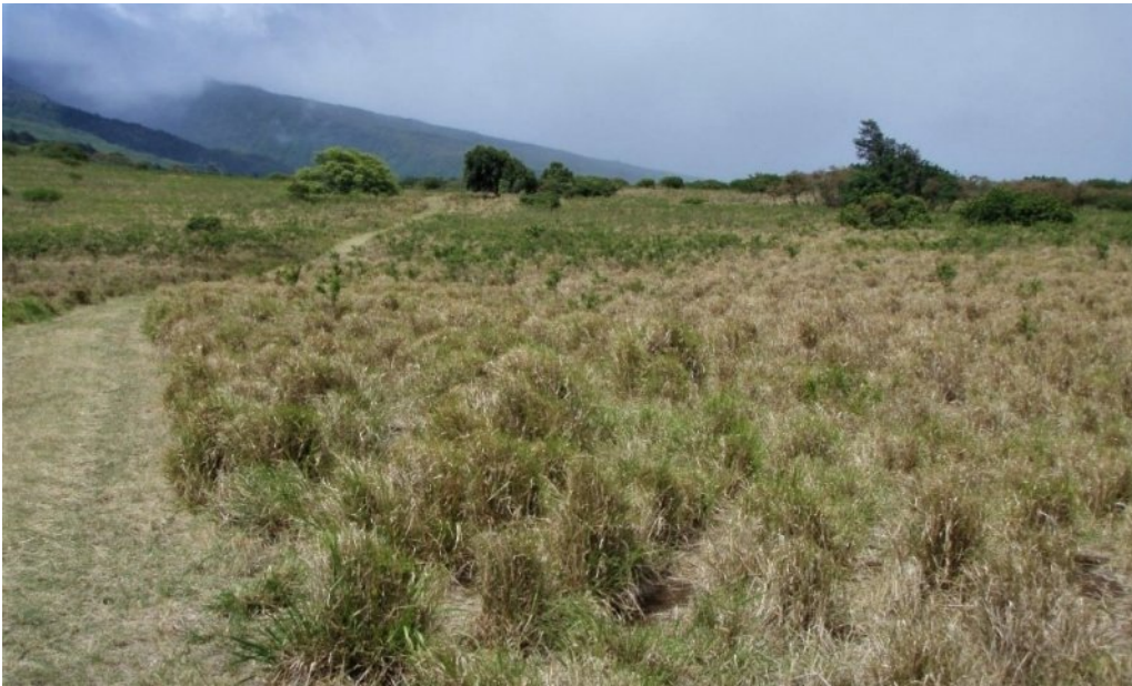
Figure 2. Reference State, Phase 1.1. Guineagrass grassland. Kaupo very stony silty clay loam, 3 to 25% slopes (KLUD), elevation 400 feet, annual rainfall 40 inches. David Clausnitzer, 7/28/08.

Preferred forage species are guineagrass ( Urochloa maxima ), the small leguminous tree koa haole or white leadtree ( Leucaena leucocephala ), and the leguminous vine glycine ( Neonotonia wightii ). With continuous heavy grazing (cattle, horses, goats or deer), preferred forage grasses decrease, as will preferred small trees, vines, and shrubs. Less preferred grass, forb, and shrub species increase under such circumstances. With severe deterioration, shrubby species can increase to eventually dominate. Christmasberry ( Schinus terebinthifolius ) is common.