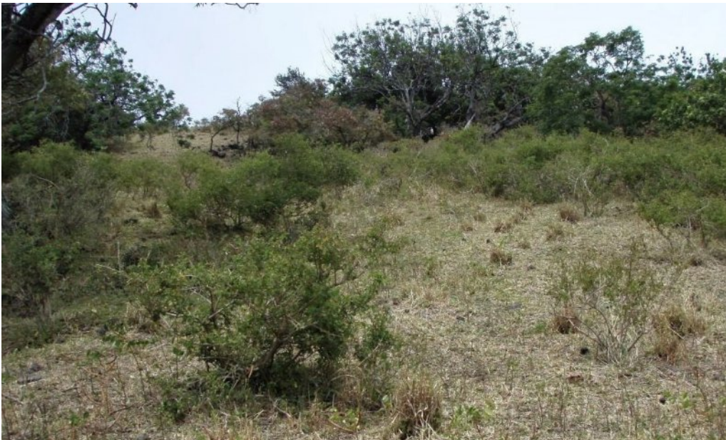
Figure 3. State 4 Shrub Invaded Grassland, Phase 4.1. Guineagrass grassland invaded by christmasberry and lantana. Kaupo extremely stony silty clay loam, 3 to 25% slopes, elevation 900 feet, annual rainfall 40 inches. David Clausnitzer, 7/28/08.

Christmasberry (Brazilian peppertree)/aalii – lantana/Asian swordfern Schinus terebinthifolius / Dodonaea viscosa – Lantana camara / Nephrolepis multiflora syn. N. brownii