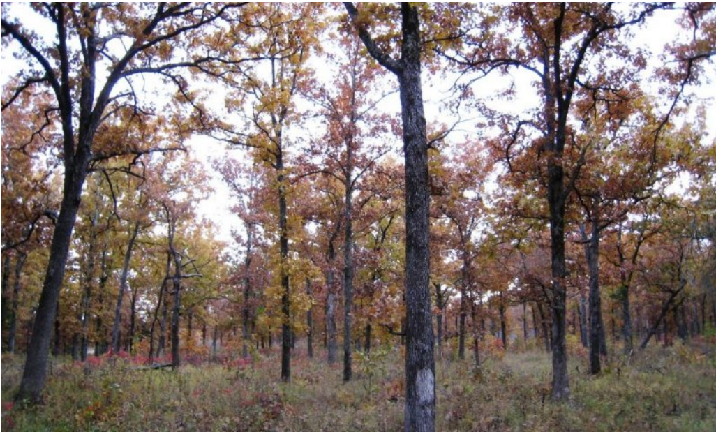
Figure 11. St. Francois State Park, MDNR, St. Francois Co.