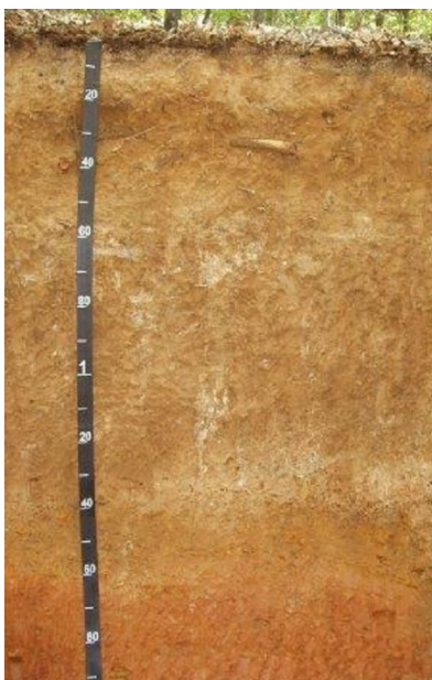
Figure 9. Loring series

The accompanying picture of the Loring series shows a thin surface horizon and a light-colored albic horizon over a brown silt loam subsoil at about 20 cm. A fragipan is below about 55 cm in this picture. The fragipan is a barrier to roots. scale is in centimeters.