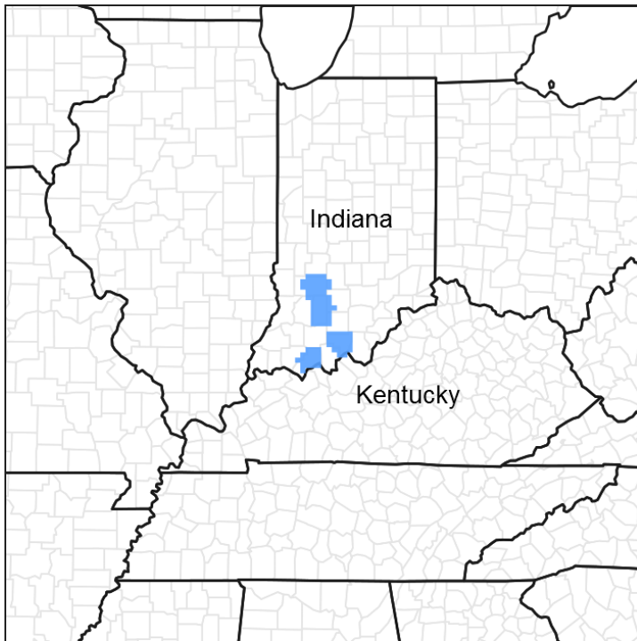
Figure 1. Mapped extent

Provisional. A provisional ecological site description has undergone quality control and quality assurance review. It contains a working state and transition model and enough information to identify the ecological site.