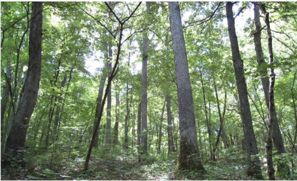
Figure 11. MDC Hart Creek Conservation Area, Boone County, MO

This community is the most productive upland forest in the MLRA. This forest community has a multi-tiered structure, and a canopy that is 75 to 100 feet tall with 80 to 100 percent closure. The sub-canopy and understory are well developed. An abundance of shade tolerant forest generalists, such as May apple, Christmas fern, tick trefoil and white snakeroot, cover the ground. In the absence of disturbance, more shade tolerant species increase such as sugar maple, basswood, white ash and others increase in importance and add structural diversity to the system. In addition, more shade-loving forest shrub (e.g., spicebush) and herbaceous (e.g., bloodroot) species also increase.