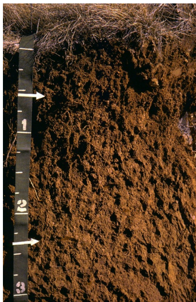
Figure 9. Menfro series soil profile

The accompanying picture of the Menfro series shows a thin, light-colored surface horizon to about 7 inches overlying the brown silt loam to silty clay loam subsoil. The excellent rooting characteristics of Menfro and other soils allow for productive, diverse reference vegetation communities on this ecological site. Scale is in feet.