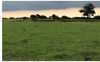
Converted Land Use

At this point it will take significant inputs to remove woody species and restore the grass dominated pasture. However, it may be achieved through brush management and a prescribed grazing plan which allows ample rest for the re-establishment of grasses.