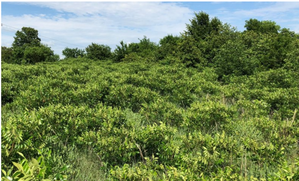
Figure 11. Durant soils. Murray County, OK

This state describes the invaded, woody dominated plant community of the Clay Upland site. The ecological processes are dominated by woody species including mesquite, honey locust, elm, and juniper species. Some herbaceous plants persist under the woody canopy or in interspaces. Usually, shade tolerant species like Texas wintergrass are prominent herbaceous components in this community. There may also be an increase in prickly pear in this state.