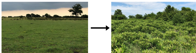
Converted Land Use