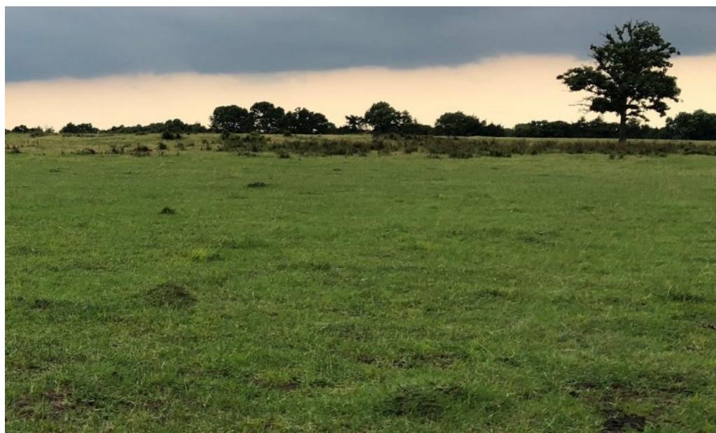
Figure 10. Ravia soils. Johnston County, OK

This state represents a change in land use from rangeland to pastureland. The soil