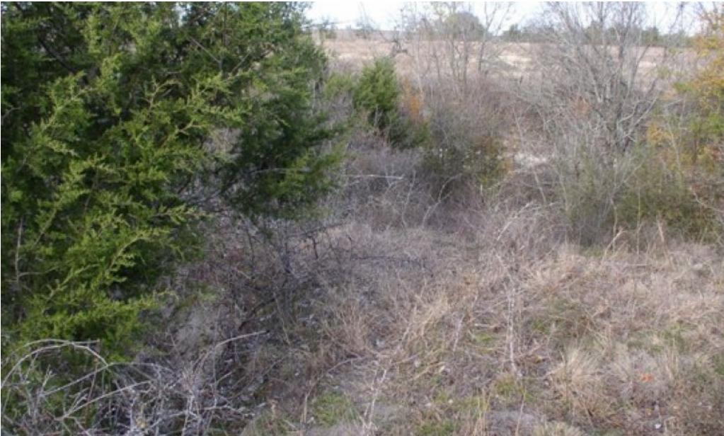
Figure 18. 3.1 Shrubland Community

This plant community is a Shrubland Community (3.1) having greater than 20% woody canopy dominated by Ashe juniper, prickly pear cactus and honey mesquite. Other species present in small amounts are elm, hackberry, and live oak. The herbaceous understory is almost nonexistent. Shade tolerant species such as Texas wintergrass tends to dominate the site where mesquite is the major woody plant. When the canopy of juniper increases toward a cedar breaks type community, most grasses have almost disappeared. Continuous grazing by domestic livestock has accelerated the shift. The tallgrass prairie can be restored by prescribed burning but will require many years of burning under very selective conditions due to light fuel load of fine fuel and the absence of a seed source for the tall grasses. (The Engling Wildlife Management Area accomplished this in three steps: 1. Prescribed burn during dry winter after frost has dropped woody plant leaves, 2. Conduct a summer prescribed burn to reduce cool-season plants and favor warm-season herbaceous plants, 3. Use combinations of winter and/or summer fires to maintain the