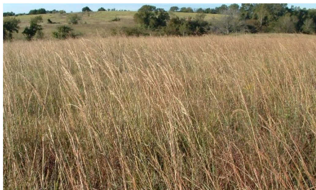
Figure 12. 1.2 Tall and Midgrass Prairie Community