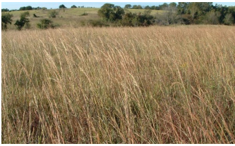
Tall and Midgrass Prairie Community

With heavy continuous grazing, no brush management, and no fire, the Tallgrass Prairie Community transitions to the Tall and Midgrass Prairie Community.