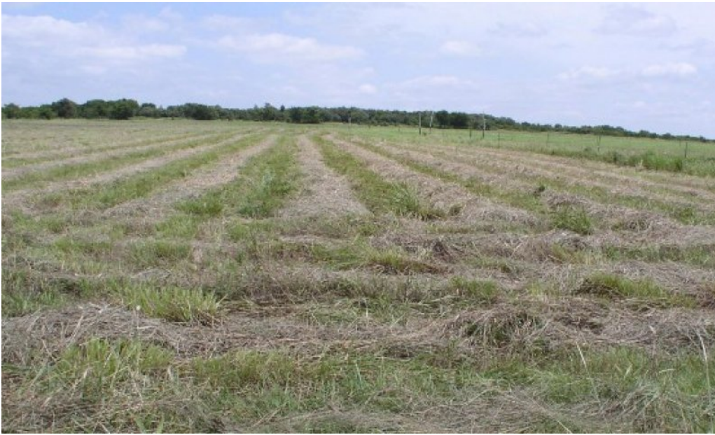
Figure 21. 4.1 Pastureland Community