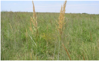
Tallgrass Prairie Community

With the implementation of conservation practices such as Prescribed Grazing, Brush Management, and Prescribed Burning, the Tall and Midgrass Prairie Community can be restored to the Tallgrass Prairie Community.