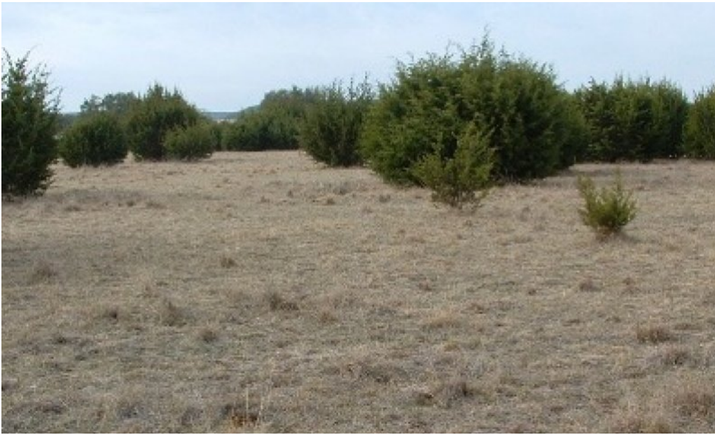
Figure 15. 2.1 Short and Midgrass Community

The Short and Midgrass Community (2.1) consists of short- and midgrasses with ten to fifteen percent canopy of woody plants. As the plant community ages, brush canopy continues to increase while midgrasses such as sideoats grama decreases and grasses such as Texas wintergrass, buffalograss, hairy grama ( Bouteloua hirsuta ), Texas grama ( Bouteloua rigidiseta ) and hairy tridens ( Erioneuron pilosum ) increase. Without fire, Ashe juniper becomes the dominant invader plant while mesquite ( Prosopis glandulosa ) and prickly pear ( Opuntia spp.) become established. Invaders such as dallisgrass ( Paspalum dilatatum ) and King Ranch Bluestem ( Bothriochloa ischaemum ) may appear and grow in the microrelief depressions or valleys. Warm-season perennial tallgrasses such as Indiangrass and switchgrass have all but disappeared. Continuous grazing by domestic livestock has accelerated this shift. The shift to this state has occurred due to the absence of fire or other means of brush suppression coupled with heavy grazing by domestic livestock. The grass species that dominate the site are mostly cool-season annual species. This state can be reverted back to near reference condition by some means of brush suppression and good grazing management. Without these management practices, the site will continue to shift toward denser stands of brush and will become the Shrubland Community (3.1) state.