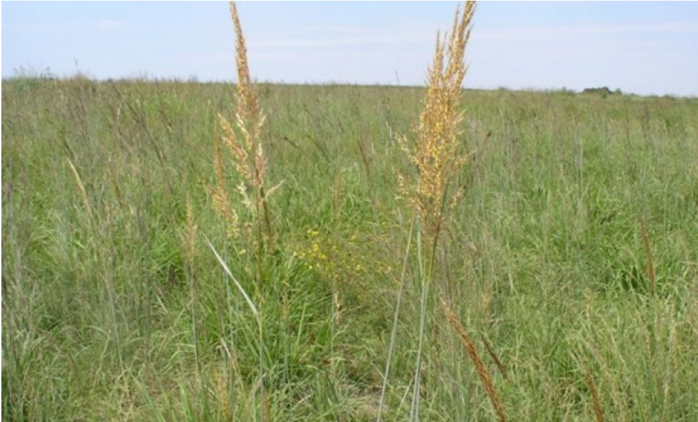
Figure 9. 1.1 Tallgrass Prairie Community