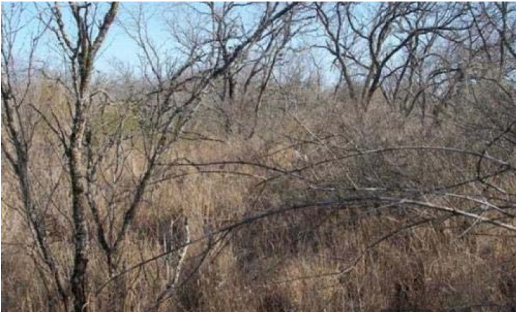
Figure 16. 2.2 Shrubland Community

In the absence of fire and brush management, a highly stable and resilient Shrubland Community develops as woody patches increase in abundance and coalesce. Mesquite and acacia overstory plants that dominate the preceding state may begin to die due to natural causes, leaving a diverse mixed-shrub community characterized by shrubs such as brasil, colima, and spiny hackberry. Ground cover and herbaceous production beneath shrub canopies is minimal. Aggressive brush management is required to affect transitions out of this state. Prescribed burning may not be possible until woody cover is reduced by herbicides or mechanical treatments to the point that grasses (fine fuels) can establish. Establishment of native grasses can be difficult and dependent upon natural seeding from remnant patches, as their seed banks in shrub patches may be depleted. Texas wintergrass, threeawns ( Aristida spp.), and annuals increase in the shade of the trees. Unpalatable invaders may occupy the interspaces between trees and shrubs. Plant vigor and productivity of grass species is reduced due to shade. Shade is a driving factor for the understory plant community. Without brush control, tree canopy will continue to increase until canopy cover approaches 80 percent. In this plant community, annual production is dominated by woody species. Browsing animals, such as goats and deer, can find fair food value if browse plants have not been grazed excessively. Forage quantity and quality for cattle is low.