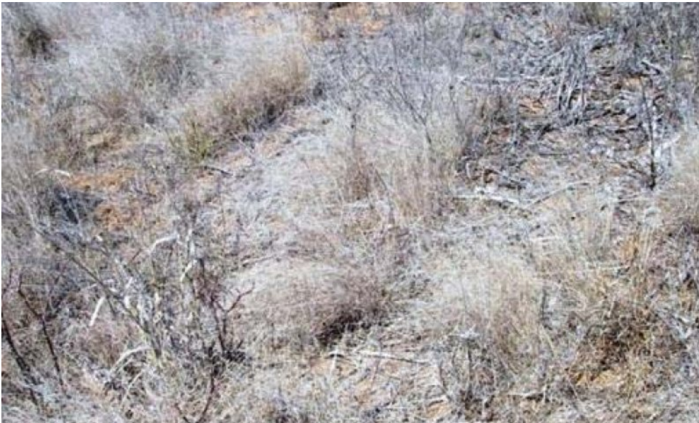
Figure 11. 1.2 Shortgrass Community

The Shortgrass Community (1.2) will return to the Midgrass Community (1.1) with brush management and proper grazing management that provides sufficient critical growing season deferment in combination with proper grazing intensity. Favorable moisture conditions will facilitate or accelerate this transition. The understory component may return to dominance by midgrasses in the absence of fire. Reduction of the woody component will require inputs of fire and/or brush control. The understory and overstory components can act independently when canopy cover is less than five percent, meaning, an increase in shrub canopy cover can occur while proper grazing management creates an increase in desirable herbaceous species. The driver for community shift 1.2A for the herbaceous component is proper grazing management, while the driver for the woody component is fire and/or brush control.