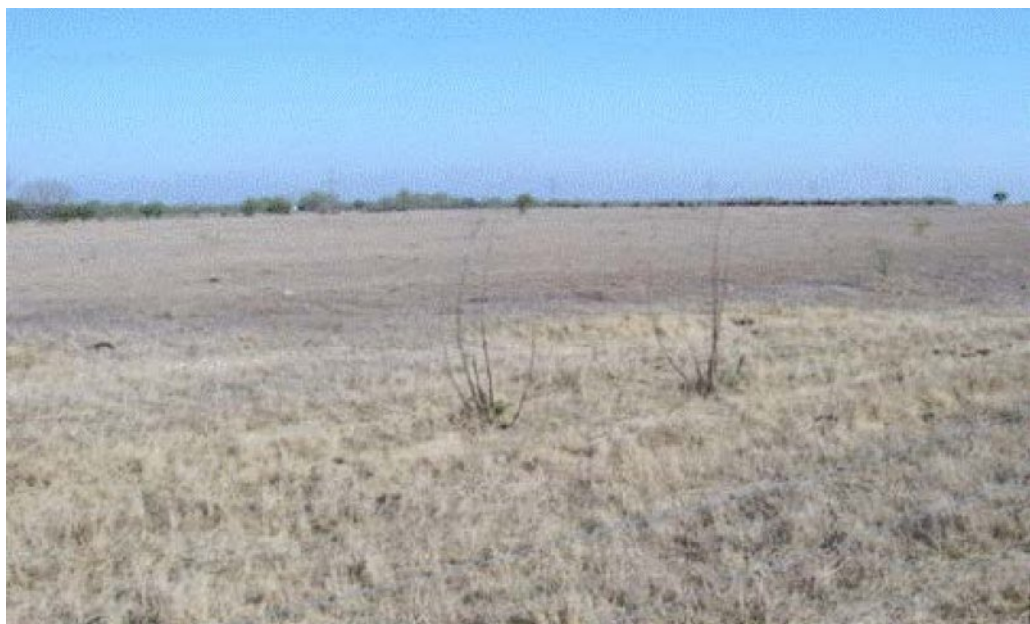
Figure 21. 3.2 Abandoned Land Community

The Abandoned Land Community (3.2) occurs when the Converted Land Community (3.1) is abandoned or mismanaged. Mismanagement can include poor crop or haying management. Pastureland can transition to the Abandoned Land Community when subjected to improper grazing management (typically long-term overgrazing). Heavily disturbed soils left alone will return to the Shrubland State (2). Abandoned croplands and land seeded with exotic or native grasses are prone to encroachment by woody plants. These areas will revert to shrublands with heavy grazing and no fire or brush management. These changes seem to be triggered by recruitment and growth of shrub plants in periods following drought. The shrubs that appear in pastures may be true seedlings established from natural dispersion to the site by wind, water, animals, or from