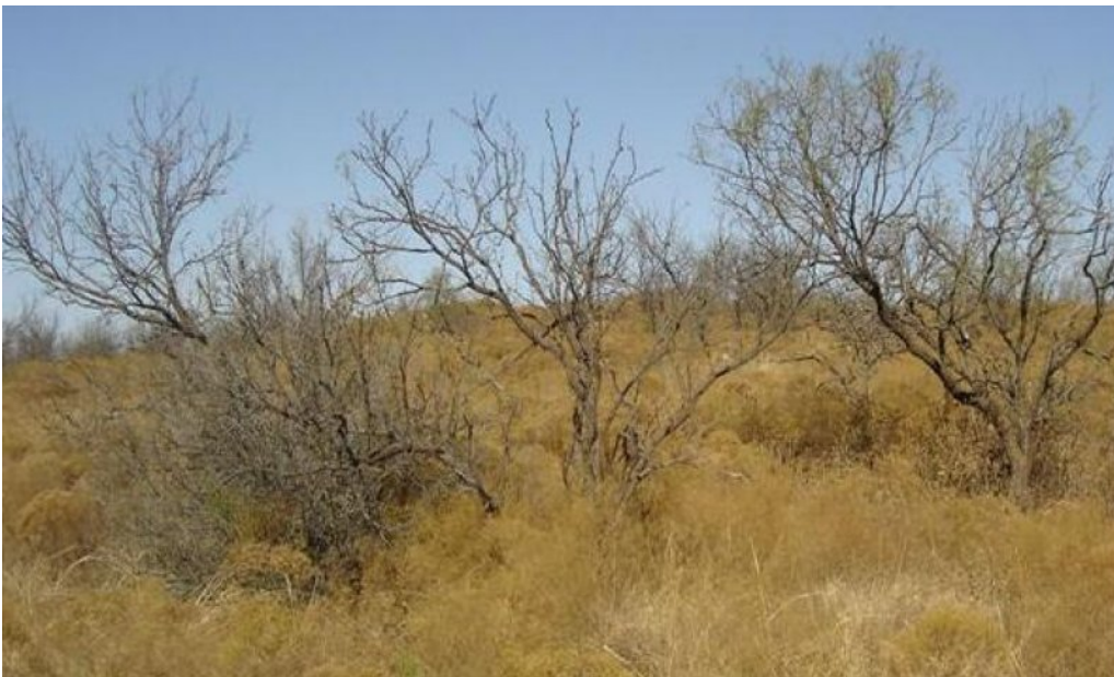
Figure 14. 2.1 Shortgrass/Forb/Shrub Community

This plant community is the result of prolonged periods of damaging disturbances and neglect which may include continuous abusive grazing and total lack of prescribed fire or brush management. Perennial shortgrasses, including buffalograss, curlymesquite, and threeawns dominate the site along with annual forbs and grasses. Invading shrubs such as mesquite, lotebush, and pricklypear increase in density and canopy, but their growth habit is stunted because of shallow soils, limited rooting depth, and lack of available moisture. A few individual plants of sideoats grama and Arizona cottontop remain in isolated areas, but silver bluestem, dropseeds, and white tridens are the most common midgrasses. Annual production ranges from 800 to 1400 pounds per acre.