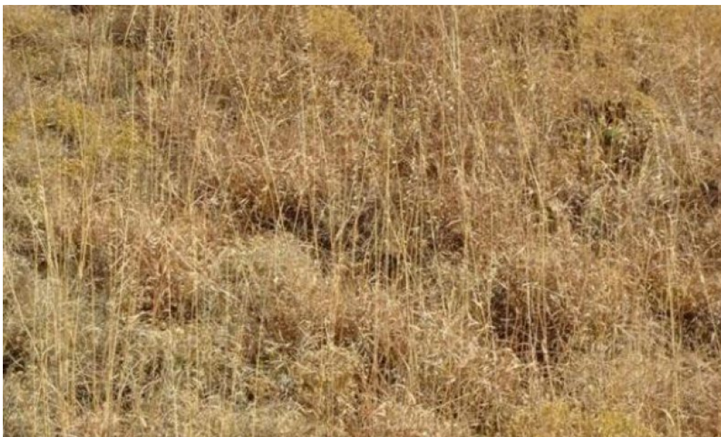
Figure 8. 1.1 Mid/Shortgrass Prairie Community

The reference plant community for the Shallow Clay ecological site is a midgrass/shortgrass prairie. In pristine conditions, the site is dominated by sideoats grama with smaller amounts of cane and silver bluestem, Arizona cottontop, dropseeds, and vine mesquite. Buffalograss, curlymesquite, and hairy grama are sub-dominant shortgrasses. Blue grama is a minor, but significant, part of the historic shortgrass component on this site. Perennial forbs are scattered across the site. Shrubs are a minor component of the plant community. Annual production ranges from 1000 to 2800 pounds per acre.