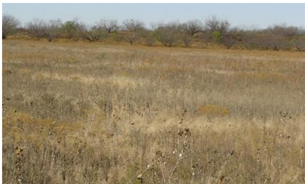
Figure 22. 4.2 Abandoned Land Community

The soils of this site are poorly suited to cultivation or conversion to pastureland. Therefore, most of the acres of this site that were cultivated in the past have been abandoned because of very low yields and poor economics. Abandoned croplands and