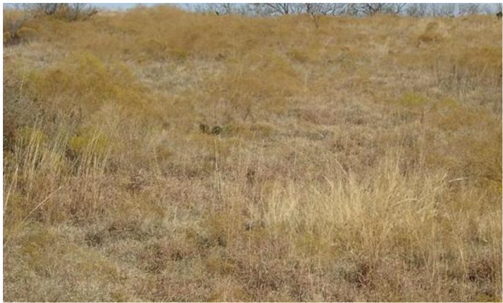
Figure 11. 1.2 Short/Midgrass Prairie Community

Sideoats grama declines because of disturbance or neglect as a result of uncontrolled grazing, lack of fire, climatic factors, or other factors. Shortgrasses such as buffalograss and curlymesquite, dominate the site along with midgrasses such as silver bluestem, dropseeds, and slim and rough tridens. Threeawns and Texas grama increase significantly. More annual grasses and forbs begin to appear on the site. Mesquite, lotebush, pricklypear, and tasajillo begin to invade from adjacent sites and the shrub canopy begins to gradually increase. Annual production ranges from 900 to 2500 pounds per acre.