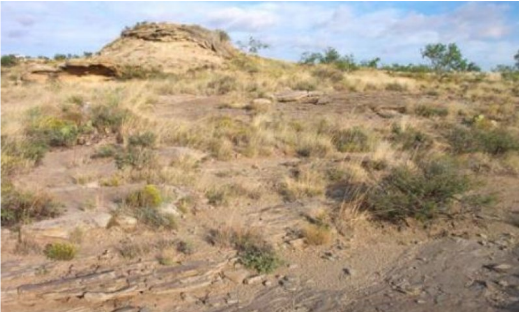
Figure 10. 2.1 Shrub/Shortgrass Community

The Shrub/Shortgrass Community (2.1) shows a less productive community of sparse vegetation. The ecological drivers are increased surface erosion from both wind and water and increase in exposed bedrock. Actual soil formation from weathered sandstone is limited. In time, weathering will increase along with deposition of soil material. Both diversity and production will gradually increase over time. It may take many years for major changes to occur. Principal species are hairy grama, perennial three-awn, broom nailwort, pricklypear, broom snakeweed, and feather dalea. Bare ground is in excess of 60 percent. Annual production ranges from 325 to 445 pounds per acre.