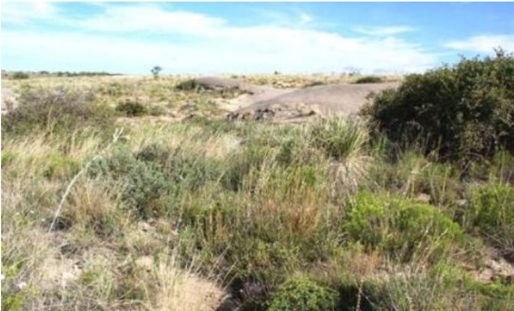
Figure 4. 1.1 Midgrass/Shortgrass/Shrub Community

The Shortgrass/Midgrass/Shrub (1.1) historic climax plant community (HCPC) is the interpretive plant community for the Shallow Sandstone Ecological Site. This community is a midgrass/shortgrass site with scattered shrubs. Soils are shallow, being derived from sandstone rock. As much as 40 percent of the land surface is exposed, slab sandstone. Production is above average for the site. Principal plant species are sideoats grama, black grama, galleta, little bluestem, and wolfstail. Perennial forbs include plains actinia, dotted gayfeather, plains zinnia, and broom nailwort. Shrubs include skunkbush sumac, plains greasebush, feather dalea, and catclaw mimosa. Scattered pricklypear and cholla may occur. Occasional oneseed juniper and hackberry may be seen. Total annual production ranges from 440 to 775 pounds per acre. This is not a preferred site for livestock due to