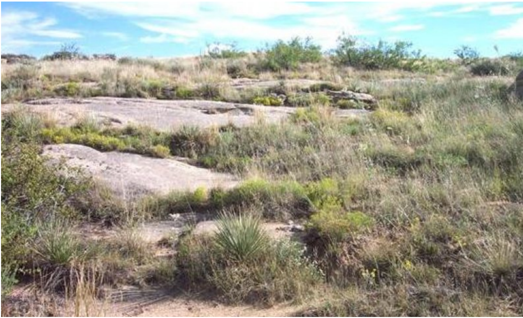
Figure 7. 1.2 Shortgrass/Shrub Community

The Shortgrass/Shrub Community (1.2) shows some subtle differences from the HCPC. These differences appear to be a part of natural fluctuations due to hydrology and soil factors. They do not appear to be due to management. Site stability has changed little. With abusive grazing and browsing, lack of fire, and long-term droughts, it is possible that deterioration in the plant community may move this phase towards the Shrub/Shortgrass Community (2.1). Increase in shortgrass production and decrease in midgrass production occur. Principal plant species are black grama, galleta, and wolfstail. Forb composition is similar to that of the HCPC, with the exception of an increase in broom snakeweed. Percent bare ground has increased. Annual production ranges from 390 to 740 pounds per acre annually, which is only a slight decrease from that of the HCPC. With careful grazing techniques and perhaps some selective individual plant treatment, the plant community may be driven towards the HCPC.