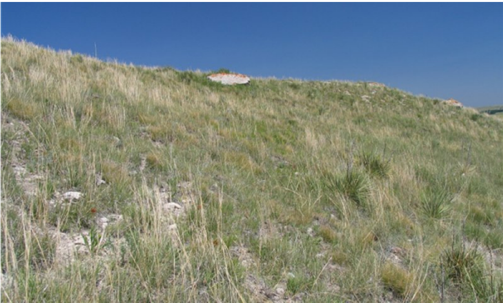
Figure 10. Plant Community Phase 1.1

reference, is dominated by a mix of warm-season and cool-season grasses and grass-like species. Heavy grazing or heavy disturbance will cause the plant community to transition to a community dominated by the upland sedges, half-shrubs, and yucca. Severe erosion is a potential outcome with heavy grazing. In pre-European times the primary disturbances included grazing by large ungulates and small mammals, and drought. Favorable growing conditions occurred during the spring, and the warm months of June through August. Today a similar state can be found in areas where proper livestock use has occurred.