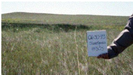
Figure 3. 58AC Saline Subirrigated 11-14" MAP Plant Community

Slight degradation in the historic climax plant community, including a beginning response to non-prescribed grazing, will tend to change the HCPC/PPC to a community represented by an increase in black greasewood or silver buffaloberry and inland saltgrass, western wheatgrass, Sandberg bluegrass and mat muhly. The medium and tall grasses such as basin wildrye, alkali cordgrass and alkali sacaton will still be present, sometimes in relatively large amounts. The desirable shrubs such as Nuttall's saltbush will be somewhat less prevalent. There may be an increase in some forbs such as poverty sumpweed and seepweed. Grass biomass production and litter become reduced on Community 2 as the taller grasses become less prevalent, increasing evaporation and reducing moisture retention. Additional open space in the community can re