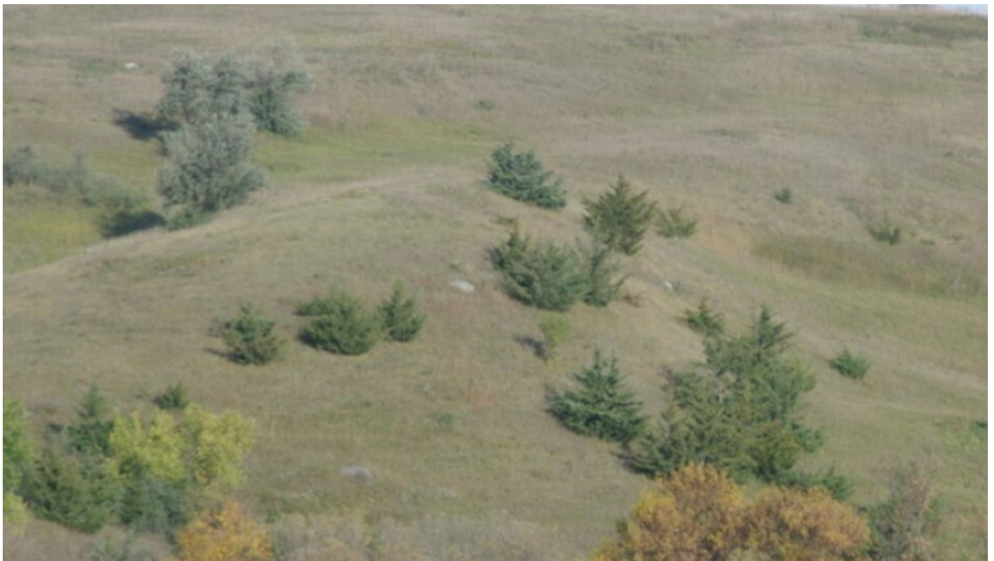
Figure 8. Regardless of specific ecological site, Eastern red cedar and Russian olive invasion on native rangeland in a formerly treeless grassland biome in MLRA 55B. Eastern red cedar and Russian olive seed