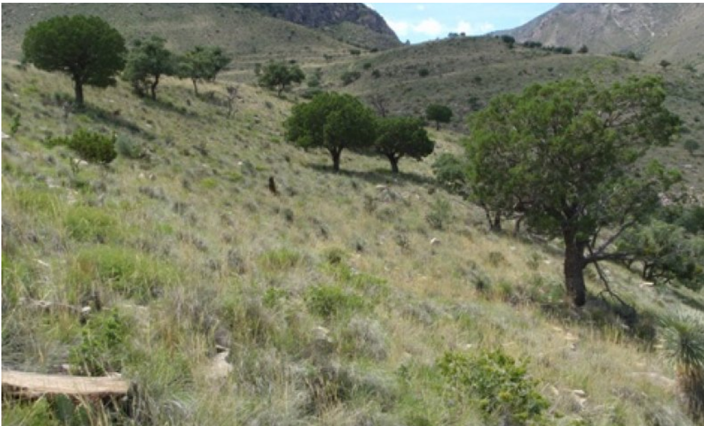
Figure 7. 3.1 Muhlys-Gramas/Oak-Juniper Community

This plant community is an inclusion within the Bonespring map unit that occurs in a cooler and wetter soil temperature regime. Soils still remain shallow to mostly sandstone with some areas derived from limestone. At Guadalupe Mountains National Park, it is found on the north facing slopes of Pine Spring Canyon and the north face slopes of the foothills of