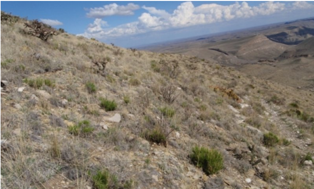
Figure 4. 1.1 Gramas/Shrubs Community

The Grama/Shrubs Community is the reference or current potential vegetative community. Characteristic grasses include sideoats grama, black grama, blue grama, Warnock’s grama, curlyleaf muhly, and New Mexico feathergrass. Shifts in above average winter or summer precipitation can shift dominance from either black grama or sideoats to cool-season grasses. In addition, the more mesic grasses such as sideoats grama, blue grama, and curlyleaf muhly will inherently be more abundant on north facing slopes while black grama will dominate south-facing slope. A variety of shrubs occurs sporadically and is characterized by winterfat, skeletonleaf goldeneye, ephedra, mariola, mountain mahogany, and New Mexico agave. Canopy cover of shrubs can range from 5-20 percent. It is unknown if the higher shrub cover in some locations is attributed to past management or it is part of the natural variability of the site. Shrub canopy cover over 25 percent will categorize the site in the Shrubland State. Annual production ranges from 600 to 1400 pounds per acre. The site is suited for livestock grazing and provides important wildlife habitat. Heavy continuous grazing over several years can reduce and potentially eliminate black and blue grama. Sideoats grama, threeawns, slim tridens, and hairy grama will increase. If there is an available seed source, shrubs may begin to encroach on the site.