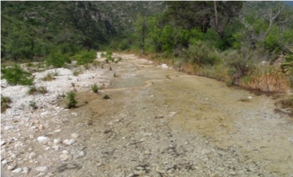
Figure 7. 1.1 Little bluestem/muhly with oak, juniper, and p

This site is characterized by several plant community potentials resulting from different plant environments. Narrow canyon bottoms will have limited daily sunlight and will typically have a high canopy cover percentages of trees such as bigtooth maple, chinkapin oak, alligator juniper, and ponderosa pine. Shade tolerant grasses will coexist. As the bottomland widens, tree canopy cover decreases and shade intolerant grasses increase such as littlebluestem, big bluestem, yellow indiagrass, bull muhly, pine muhly, and sideoats grama. Common shrubs include sotol, desert ceanothus, cliff fendlerbush, Mexican orange, apache plume, skunkbush sumac, and New Mexico agave. Grass-likes such as Jamaica sawgrass and bottlebrush sedge grow along the banks of perennial streams or areas with a very shallow groundwater depth. Scouring flash floods and small wildfires will maintain a discontinuous mosaic of plant communities.