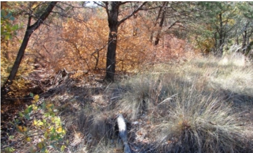
Figure 5. 1.1 Bigtooth maple, chinkapin oak, pine muhly and