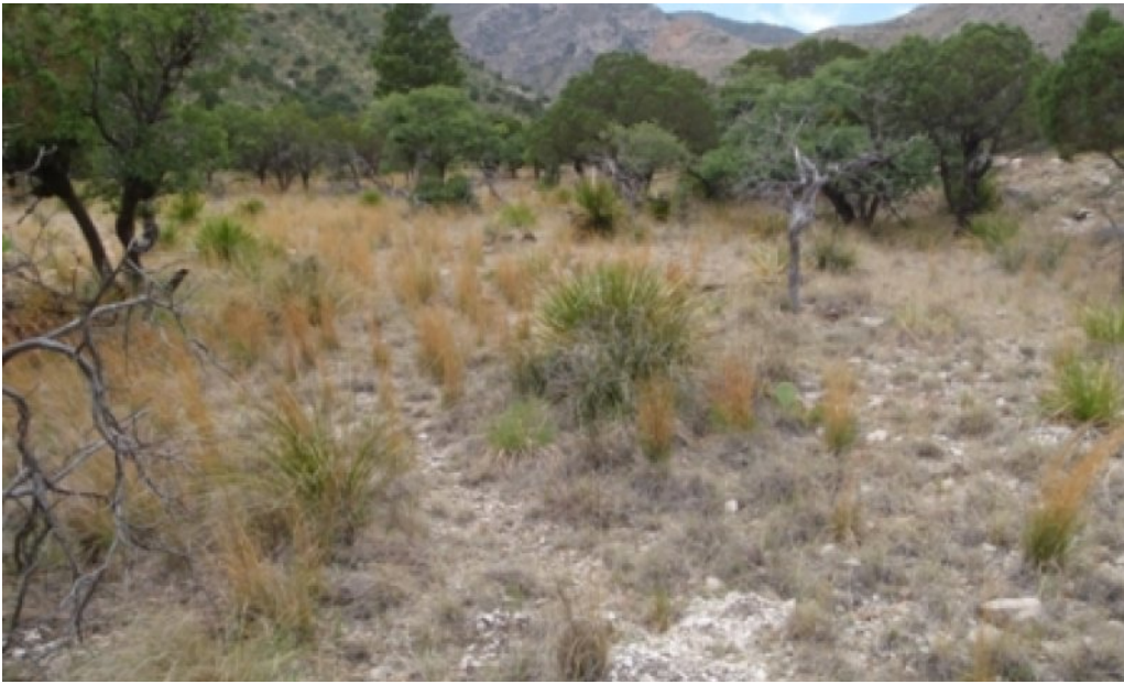
Figure 6. 1.1 Stream with Jamaica sawgrass and mixed shrubs