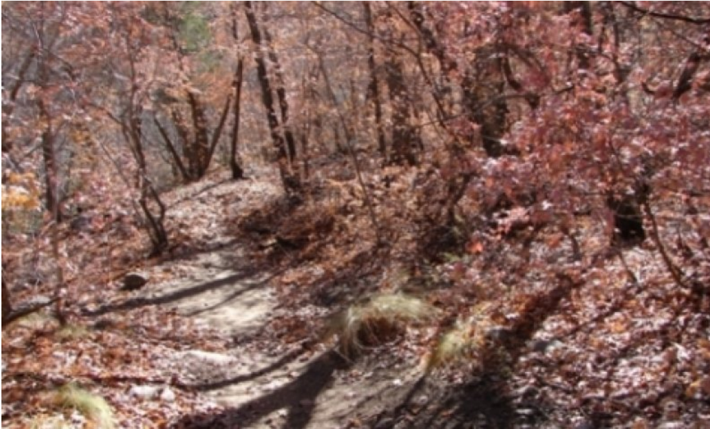
Figure 4. 1.1 Bigtooth maple with few grasses