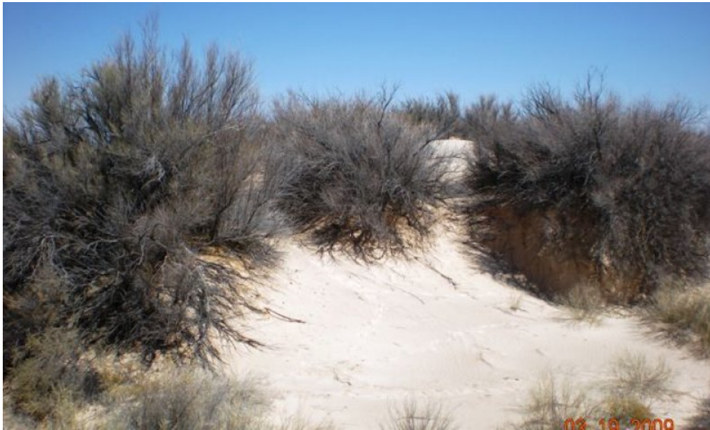
Figure 8. Saltcedar community 4.1

High seed production and the ability of saltcedar to exploit suitable habitat makes the site susceptible to the establishment of dense localized stands among the dunes.