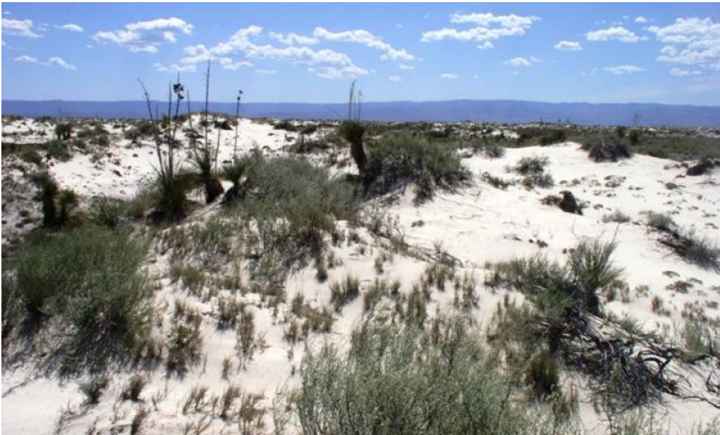
Figure 4. Shrub/mixed grass community 1.1

This is the more common community type within the vegetated dune system. Shrubs are dominant and are scattered amid the dunes usually occupying the summits of the dune. Frosted mint is typically the dominant species. Other shrubs can include skunkbush sumac, soap tree yucca, ephedra, fourwing saltbush, broom dalea, and rubber rabbitbrush. Grasses are usually the subordinate component scattered between shrubs. Sandhill muhly or gyp grama is the dominant grass species. Sandhill muhly seems to be more prevalent on the more active dunes and on dunes with coarser textured surface sands. Gypsum grama usually dominates on smaller dunes and is most prolific near the interface between the dune and the interdune. Other grasses can include Indian ricegrass, New Mexico bluestem, and mesa dropseed. In some areas rubber rabbitbrush may be the dominant shrub with sparse amounts of alkali sacaton present.