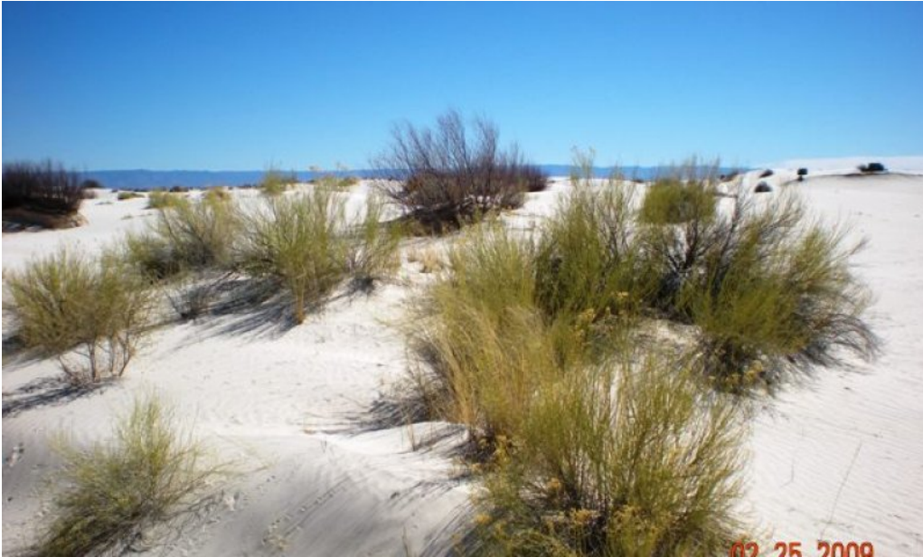
Figure 7. Shrubs/Grass/Saltcedar community 3.1

This community is characterized by the presence of saltcedar amid mixed shrubs and scattered grasses. Shrubs typically include rabbitbrush, frosted mint, and skunkbush sumac. Grass species for this community typically include alkali sacaton, sandhill muhly, and Indian ricegrass.