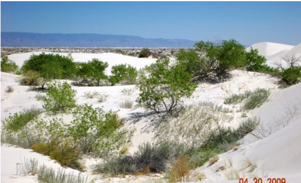
Figure 6. Cottonwood/Mixed shrubs community 2.1

The plant community of this state is dominated by Rio Grande cottonwoods. Other species include frosted mint, rabbitbrush, skunkbush sumac, alkali sacaton and Indian ricegrass. It occurs infrequently in isolated small groves. It tends to inhabit the higher dunes amid the parabolic dunefields and occasionally on barchanoid type dunes. One theory as to why cottonwoods are able to survive in the midst of the dunes is they are located along a perched freshwater lens above the more saline groundwater. The trunks of the cottonwood can elongate relatively fast, and they can also generate adventitious shoots. These aid in oxygen supply and distribution which assists the attempt to stay ahead of dune sand burial rates.