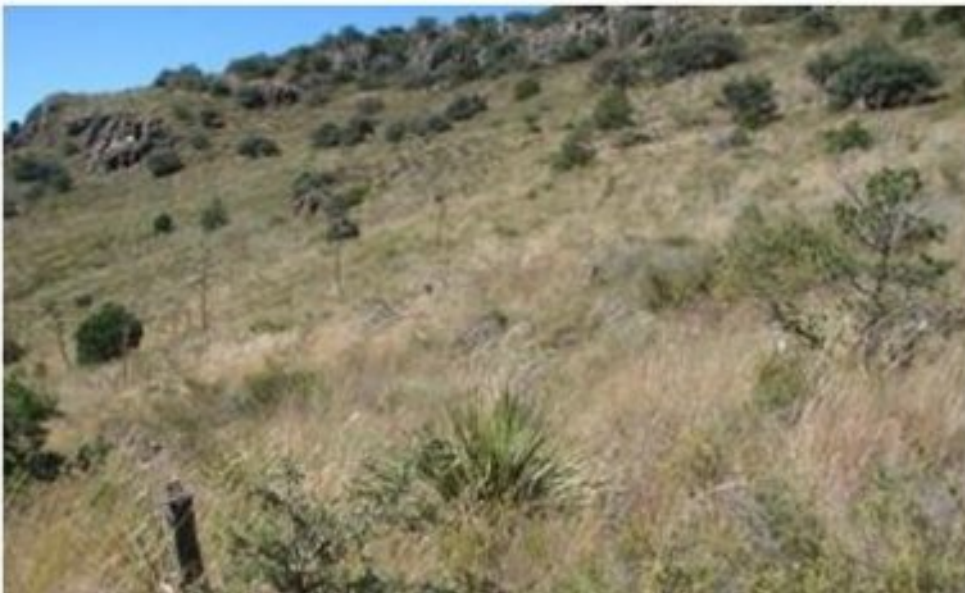
Figure 5. 1.1 Pinyon-Juniper Woodland (North Slopes) or Oak

The pinyon-juniper woodland and the oak savannah are the reference plant communities for the north and south facing slopes, respectively. East and west facing slopes are considered to be a part of the south facing plant community. North facing slopes tend to be cooler and wetter, while south facing slopes are warmer and drier. The two reference plant communities are independent of each other and are not a product of succession. Management strategies will differ mostly because of varying forage quantity and wildlife habitat structure. Fire management will also differ because of different potential fuel accumulation and woody plant density. Depending on soils, slope, elevation, and other environmental factors, other plant communities can exist within the site (such a finestem needlegrass dominated montane meadow), but the two reference communities are the most predominant. In addition, the Chisos and Davis Mountains differ considerably in size and distance from each other with vast areas of Chihuahuan Desert plant communities in between. The concept of island effects or island biogeography is expressed within the two mountain ranges. On corresponding north aspects with similar elevation and soil parent