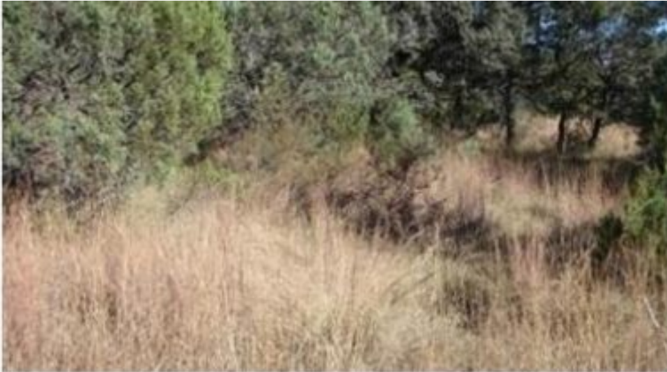
Pinyon-Juniper Woodland – North Facing Slopes