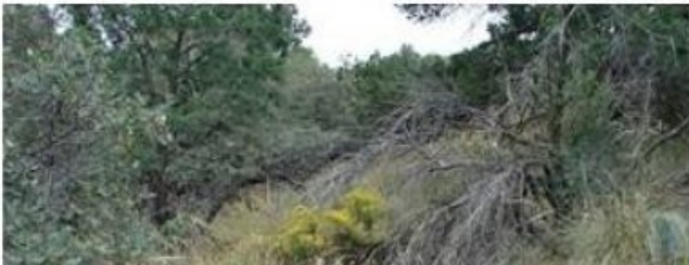
Figure 8. 2.1 Pinyon-Juniper Forest (North Slopes) and Oak W

These plant communities are the result of livestock overgrazing and direct fire suppression. Overgrazing reduces the amount of fine fuels needed for natural fires to occur. This provides a competitive advantage to woody plants. Climate limitations will most likely prevent the oak woodland on south facing slopes to transition to a closed forest. Increases in shrubs such as catclaw mimosa are observed. On cooler and wetter north facing slopes, a closed canopy pinyon-juniper forest dominates. There is reduction of shade intolerant grasses and increases in shade tolerant grasses such as pinyon ricegrass and finestem needlegrass. Proper grazing management (adequate rest to allow recovery of some grasses) followed by prescribed fire and/or thinning will help transition the community back to composition similar to the reference. On some closed canopy north facing slopes, prescribed burns may be difficult to accomplish because tree density thresholds may have been surpassed. On south facing slopes prescribed fire can more easily be accomplished because of the more open canopy and greater amounts of fine