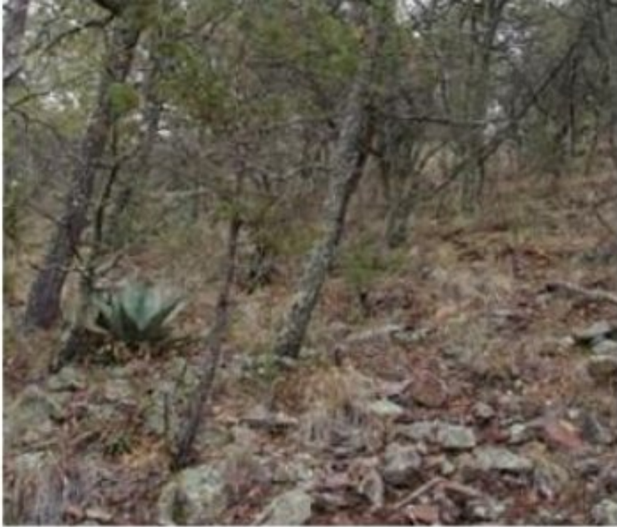
2.1 Pinyon-Juniper Forest – North Facing Slopes