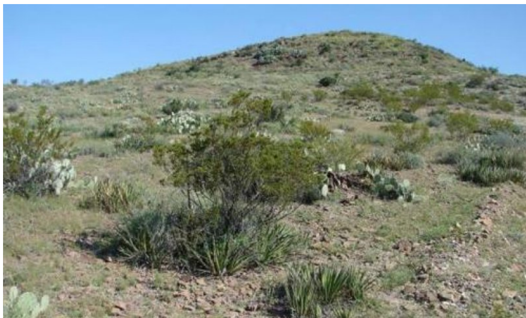
Figure 8. 1.2 Shortgrass Dominant Community

This plant community is the result of improper grazing management. Shortgrasses such as false grama and annual grasses dominate. Midgrasses are present, but mostly protected within woody plants. Lechuguilla and creosotebush begin slowly increasing. Hydrologic function is not optimized. With prescribed grazing the plant community can still return to a community similar to the reference community.