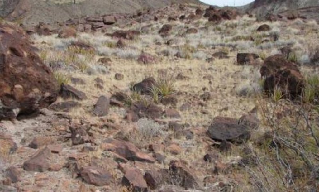
Figure 5. 1.1 Midgrasses/Mixed Shrubs Community

Grasses within this plant community total approximately 70% of the total species composition by weight, while woody plants and forbs account for 22% and 8% respectively. Tobosa and false grama are the dominant grasses while mesquite, lechuguilla, and leatherstem are dominant shrubs. The clayey soil allows for favorable water holding capacity following rain events. Surface fragments slow water runoff and provide protection for some plants from total herbivory. Ecological process (water cycle, nutrient cycle, and energy flow) are functioning with optimum efficiency due to the adequate amount of organic materials and surface fragments that cover the soil surface. Extended dry weather causes an overall decline in grass cover and production and can cause some retrogression. However, the HCPC evolved with plants that have drought tolerance. Long term retrogression is triggered primarily by abusive grazing which causes an immediate decrease and eventual eradication of the most palatable plants such as Arizona cottontop, sideoats grama, and menodora. Improper grazing management will transition the site to a shortgrass dominated plant community (2.1). Conservation practices such as prescribed grazing can help maintain ecological integrity within the reference plant community. Stocking rates need to be flexible and adjusted to carrying capacity because of sporadic rainfall.