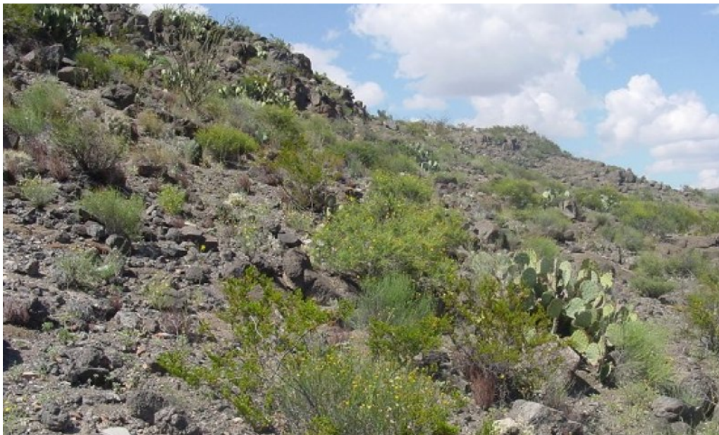
Figure 8. 2.1 Mixed Shrub Dominated Community

Shrubs are replacing grasses and palatable forbs in the Mixed Shrub Dominated Community (2.1). Drought, when combined with overgrazing can exacerbate the change. The historically dominant grass species decline and are replaced by perennial threeawns ( Aristida spp.) and other short grasses. Shrubs such as lechuguilla ( Agave lechuguilla ), creosote bush ( Larrea tridentata ), and pricklypear increase within the site until there is approximately 40% woody species present. This is due to the collective influence of