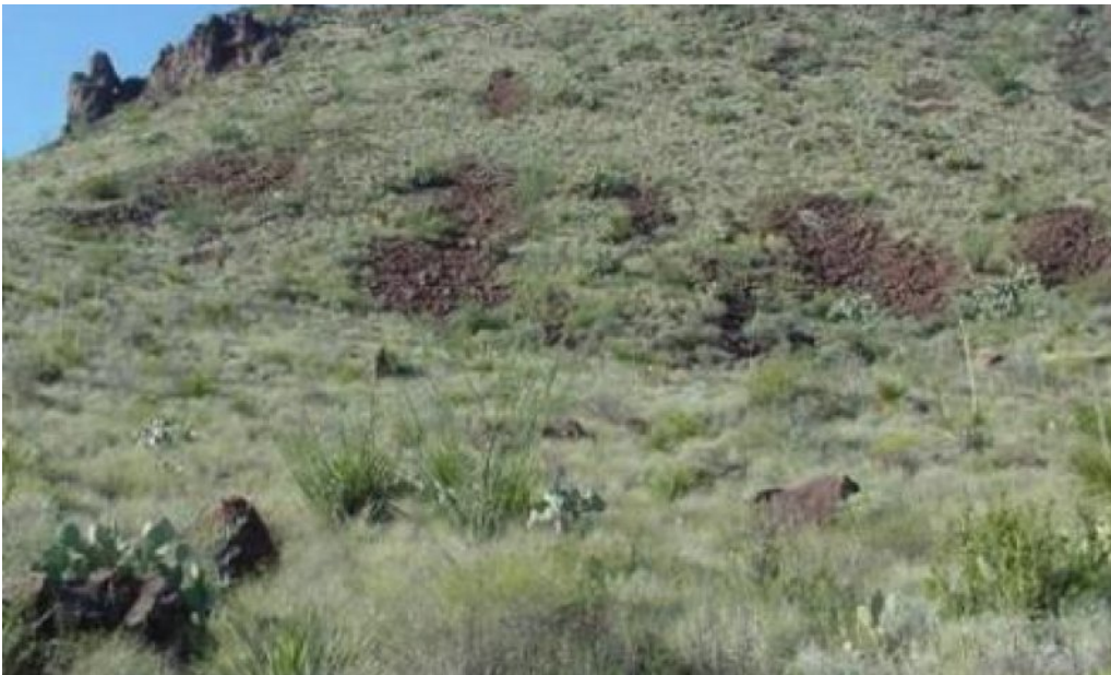
Figure 5. 1.1 Chino Grama/Shrub Community