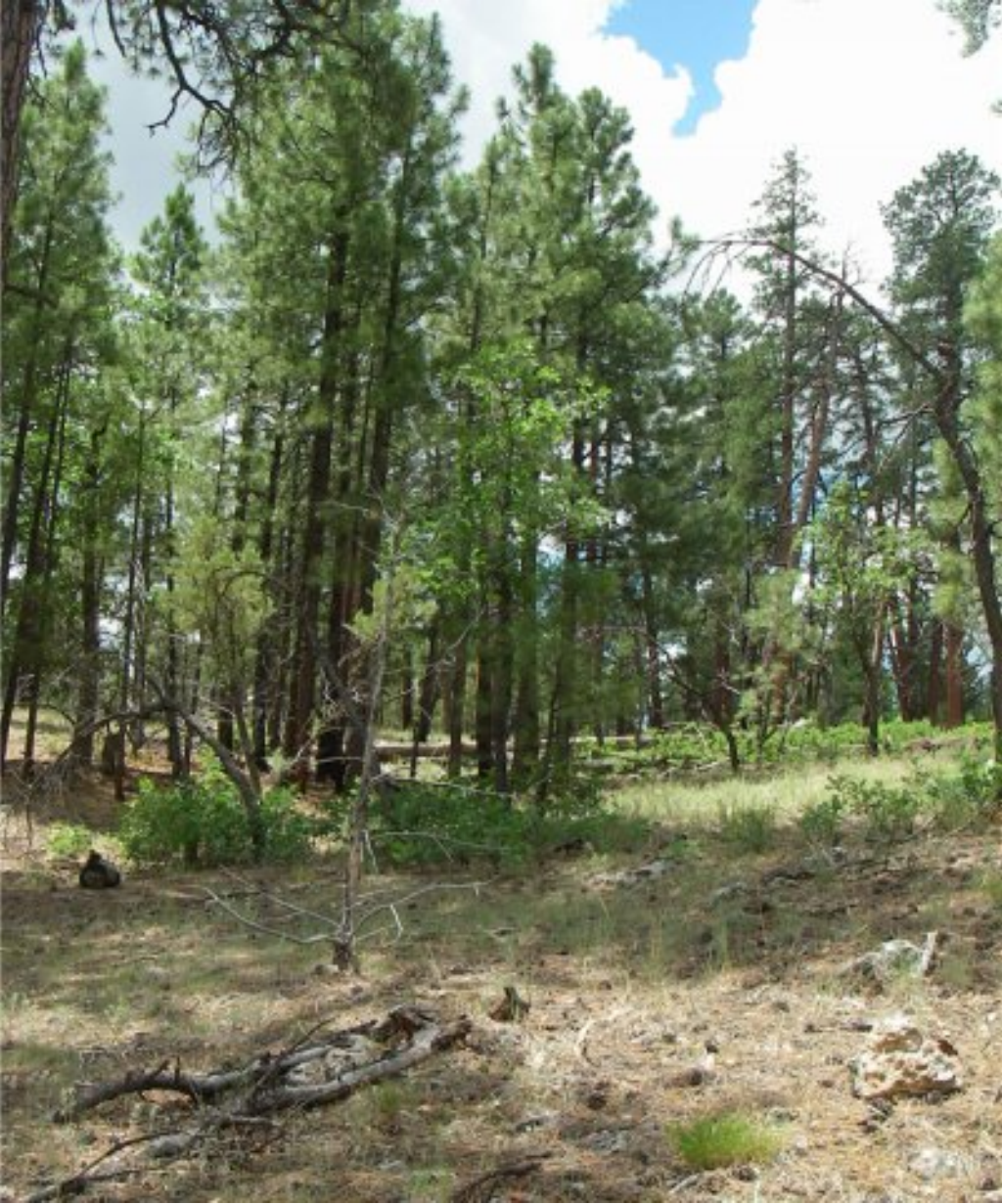
Table 5. Annual production by plant type