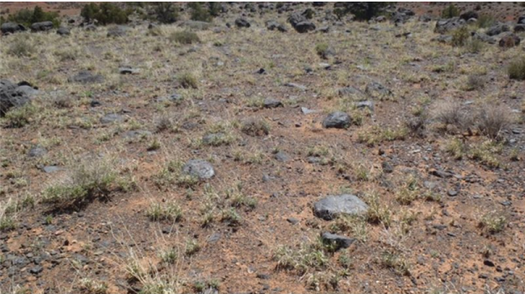
R035XY242UT—Semidesert Gravelly Loam (Shadscale). Community Phase 1.1—Shadscale and Galleta

The reference state is highly resistant to change due to the general lack of fire or other natural disturbances, and a harsh soil environment that does not support many invasive species. The fuel loads are too sparse to carry a fire under normal weather conditions, and insect or disease impacts have not been documented to have a major impact on the plant community of the site. The resulting condition is a reference state that perpetuates itself on the site indefinitely under natural historical conditions. Soil surface disturbance from recreation, livestock, or natural means may increase the likelihood that cheatgrass, Russian thistle, or halogeton establishment on this site. These invasive species may establish in the absence of any major disturbance, but they are not known to dominate this site at the present time.