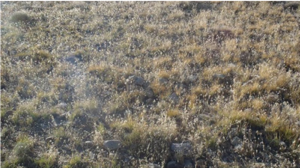
R035XY242UT—Semidesert Gravelly Loam (Shadscale). Community Phase 2.1—Invaded Shadscale and

This state is functionally and structurally similar to state 1, however it allows for the presence of non-native species. As a result of the establishment of non-native species, the resilience of this state is less than the reference state. Cheatgrass, Russian thistle, and/or halogeton are the most likely invaders to occur in this state.