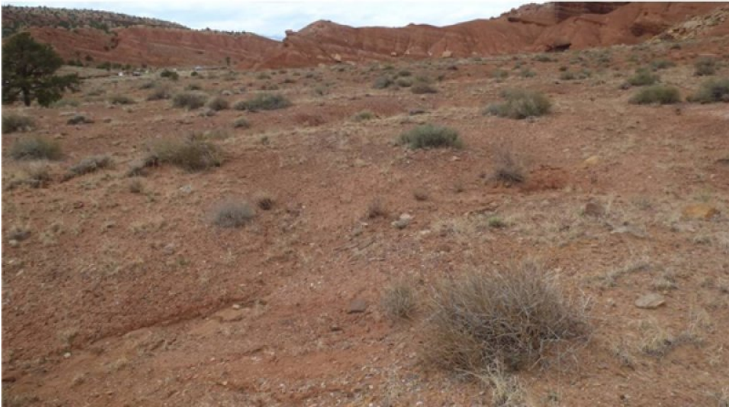
Figure 5. Phase 1.1

This plant community often consists of diverse shrubs, with shadscale being the most common. Torrey's jointfir, Bigelow sage and corymbose buckwheat may also be very abundant. Forbs are typically sparse and common grasses are Indian ricegrass and James' galleta. Composition by air-dry weight is 10-40% grasses, 2-10% forbs, and 55-85% shrubs.