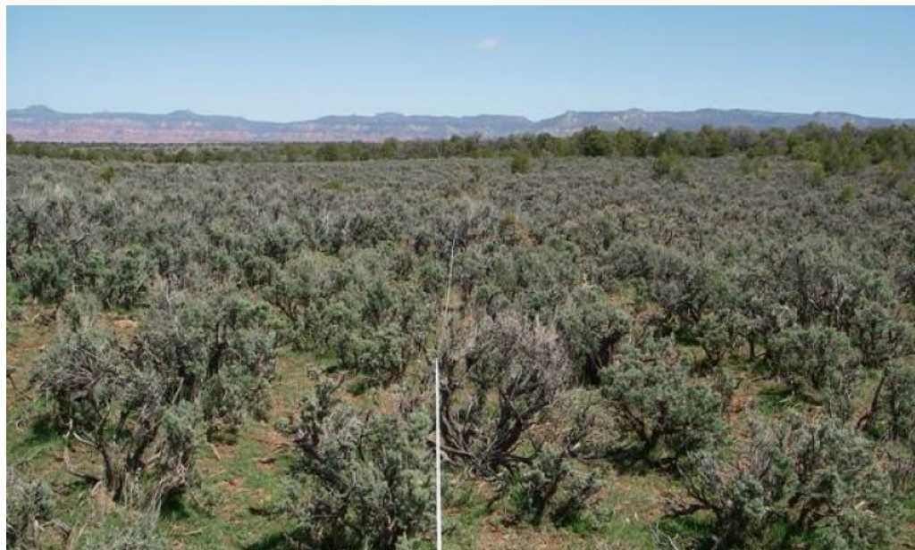
Figure 5. 35.6 Loamy Upland

The dominant aspect of the site is a grass-shrub mix. Major grasses include western wheatgrass, blue grama and bottlebrush squirreltail. Dominant shrubs are mountain and Wyoming big sagebrush.