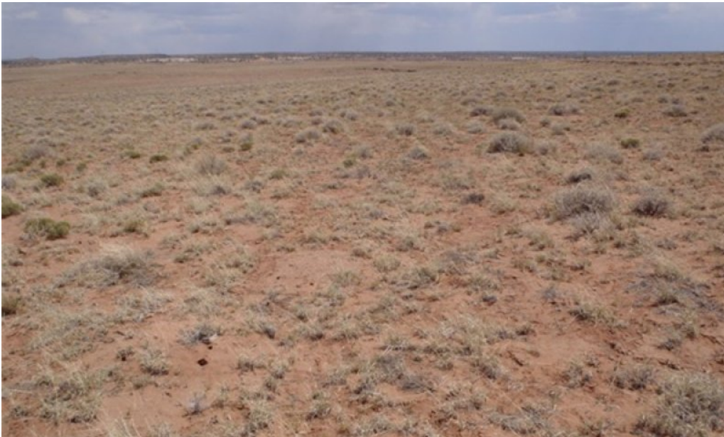
Figure 5. Sandy Loam Upland, Saline (ATCO, PLJA, ACHY)

This site has a plant community made up primarily of mid and short grasses with a relatively small percentage of forbs and shrubs. In the original plant community there is a predominance of grasses with shrubs, half shrubs. Grasses are abundant and include Indian ricegrass, galleta and alkali sacaton. Shadscale is the major shrub. Plant species most likely to invade or increase on this site when it deteriorates are broom snakeweed, rabbit brush, pricklypear cactus and annuals.