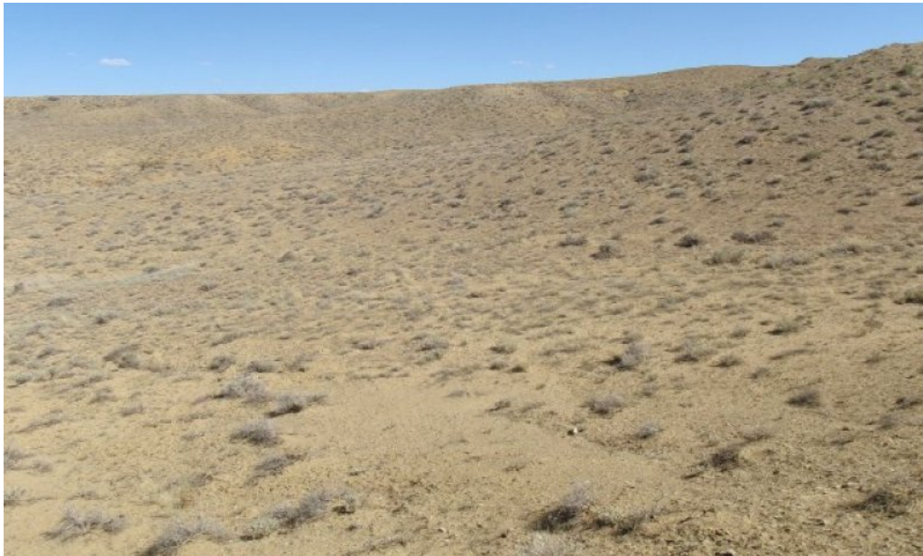
Figure 5. Shale Hills 6-10" p.z.

This phase is characterized by shadscale saltbush, mound saltbush, and sickle saltbush with alkali sacaton, galleta, and Indian ricegrass.