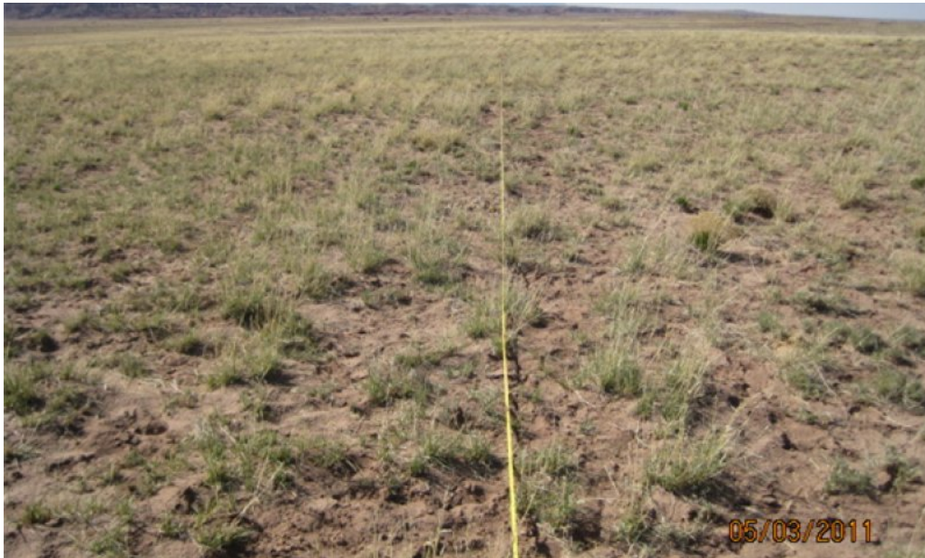
Figure 5. Sandy Loam Upland 6-10" p.z. Saline-Sodic

This plant community is made up primarily of mid and short warm season grasses and cool season grasses with a relatively small percentage of forbs and some low growing shrubs. Dominant grasses are Alkali sacaton and Indian ricegrass with lesser amounts of galleta and dropseeds.