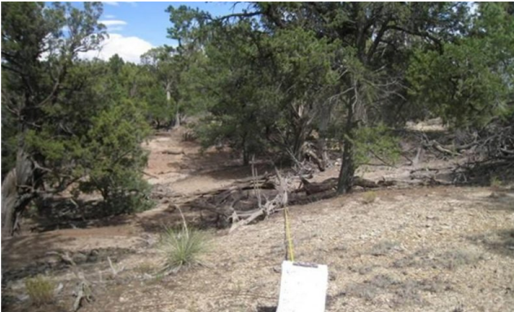
Figure 5. Sandstone Upland 13-17" p.z.

Trees dominate the overstory, but shrubs and grasses are common in the understory. The native overstory canopy is generally 40-50%, but can range from 25-65%. Pinyon pine dominates the canopy at higher elevations and has a more even composition at lower elevations. The understory plant community composition is comprised of about 20% grasses, 55% shrubs, 5% forbs and 20% trees (under 4.5 feet tall). Dominant grasses are muttongrass, squirreltail, blue grama, Indian ricegrass with big sagebrush, green mormon tea, cliffrose and snakeweed.