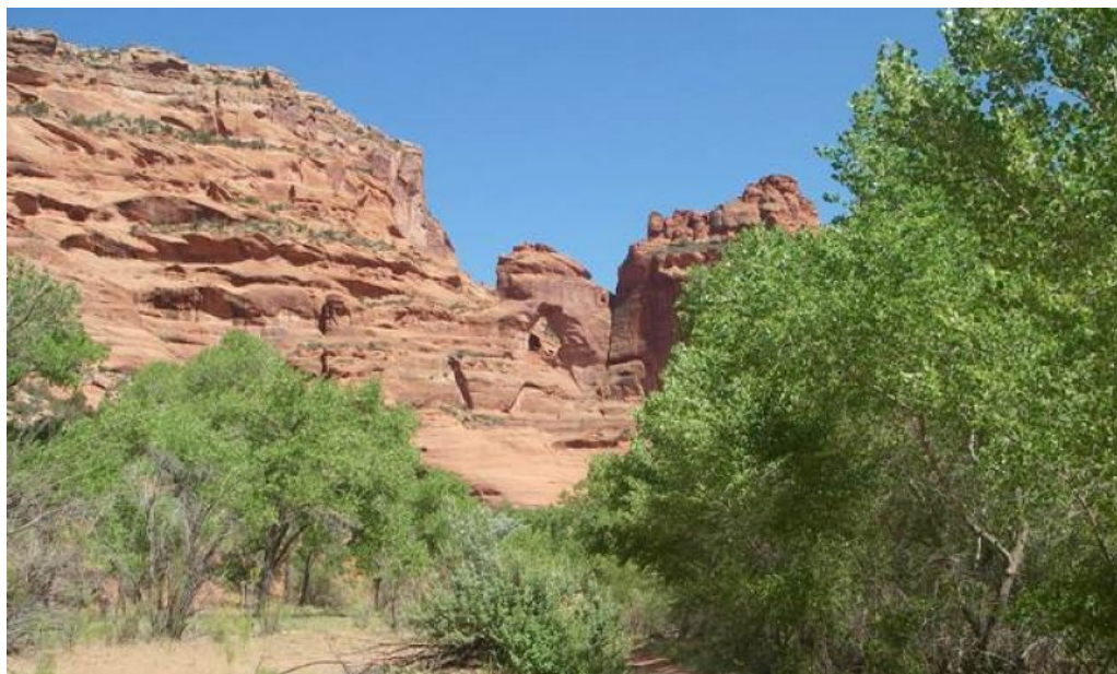
Figure 5. Sandy Loam Bottom

The Historic Climax Plant Community (HCPC) is dominated by a canopy of Rio Grande cottonwood ( Populus deltoides ssp. wislizenii , with lesser amounts of red willow ( Salix laevigata ) and other native willows. The understory is a mix of shrubs such as redosier dogwood ( Cornus sericea ) and chokecherry ( Prunus spp.) with cool-season and warm season grasses and forbs. Overstory canopy cover can come close to 90 percent, but will fluctuate with flood events under natural conditions. These fluctuations allow gaps in the canopy that are important for the recruitment of young cottonwoods and willows into the overstory.