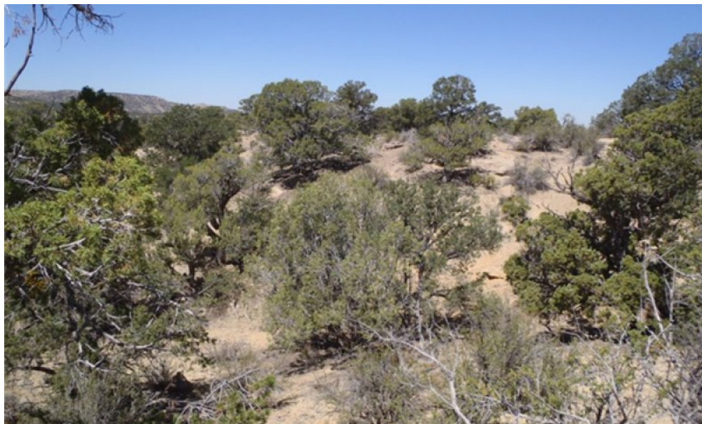
Figure 5. Sandstone Hills 10-14" p.z.

In the this plant community shrubs and trees dominate the plant community. The understory is mostly grasses with small percentage of forbs. Tree canopy ranges from 5 to 20% depending on aspects and elevations. In the understory there is a mix of cool and warm season grasses. Common shrubs include Stansbury cliffrose and Bigelow sage. At the highest elevation Wyoming big sagebrush will replace Bigelow sage.