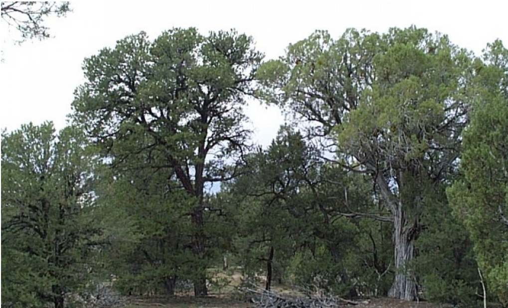
Figure 5. Sandy Loam Upland 13-17" p.z. 1.1 Plant Community

This plant community is a woodland site with the overstory dominated by Pinyon (PIED) and Juniper (JUMO or JUOS). The canopy cover ranges from 50-60%. Pinyon is 50-80% and juniper is 20-50% of the canopy composition. The understory composition is predominately grasses, such as blue grama, squirreltail, Indian ricegrass and muttongrass; and shrubs, such as big sagebrush and antelope bitterbrush. Grasses and grass-like plants are 30-50% understory composition and shrubs are 30-40%. Small trees (<4.5') comprise about 10% of composition.