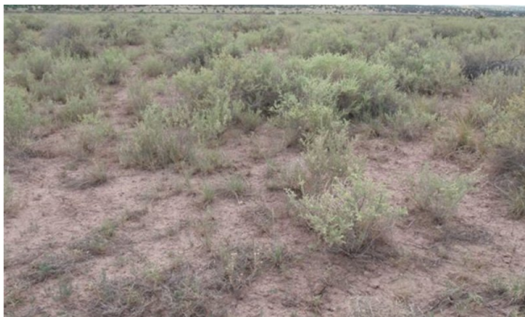
Figure 9. Fourwing shrubland

The aspect of this plant community is a shrubland. The plant community is dominated by fourwing saltbush with galleta, western wheatgrass and lesser amounts of alkali sacaton. Unmanaged grazing, run-in moisture/rare flooding, lack of fire and drought can maintain the shrub component.