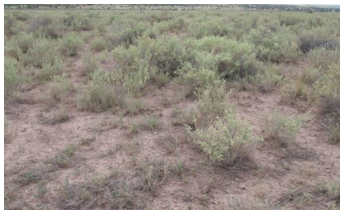
Fourwing saltbush/Galleta-western wheatgrass