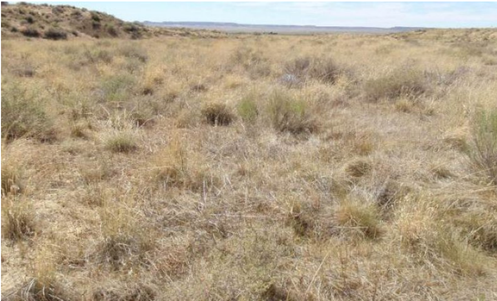
Figure 5. Alkali sacaton grassland (Dormant)

This plant community is about 70 to 80% grasses, 5 to 10% forbs, and 10 to 20% shrubs based on air dry weight. Alkali sacaton dominates the plant community, making up to 40% of the total annual production of the site. Western wheatgrass is the subdominant. blue grama, galleta grass, vine mesquite, sideoats grama grass, fourwing saltbush and winterfat are important indigenous components. If retrogression is from unmanaged grazing, alkali sacaton, western wheat, vinemesquite, and sideoats grama decrease. Three awn, tumble grass, ring muhly, burrograss and inferior forbs and shrubs can increase. Plant species most likely to increase on a deteriorating condition are rabbitbrush, broom snakeweed, wooly groundsel, annuals and cacti.