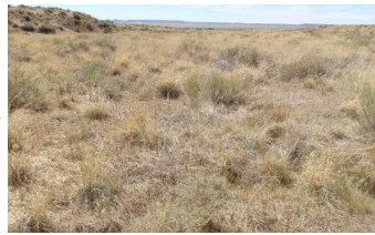
Alkali sacaton-western wheatgrass/Fourwing saltbush (HCPC)

Prescribed grazing, reduction of shrub canopy through drought, insect herbivory, or fire with a seed source for grasses along with periods of favorable moisture can return the plant community to the historic climax plant community