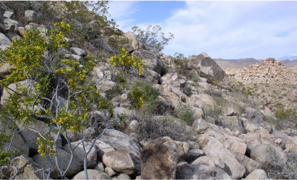
Figure 4. Community Phase 2.1

State 2 represents the current range of variability for this site. Non-native annuals including red brome, Mediterranean grass, and redstem stork's bill are naturalized in this plant community. Their abundance varies with precipitation, but they are at least sparsely present (as current year's growth or present in the soil seedbank). The ecological dynamics for the site have not changed significantly.