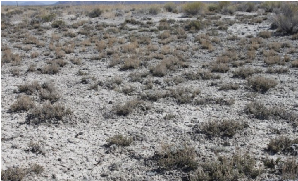
Figure 10. Barren Fan 8-12" (R028BY040NV) T.Stringham May 2012

Pygmy sagebrush and other shrubs increase while Indian ricegrass and needleandthread grass decline. Bare ground increases along with annual weeds. Rabbitbrush may increase. Prolonged drought may lead to an overall decline in the plant community.