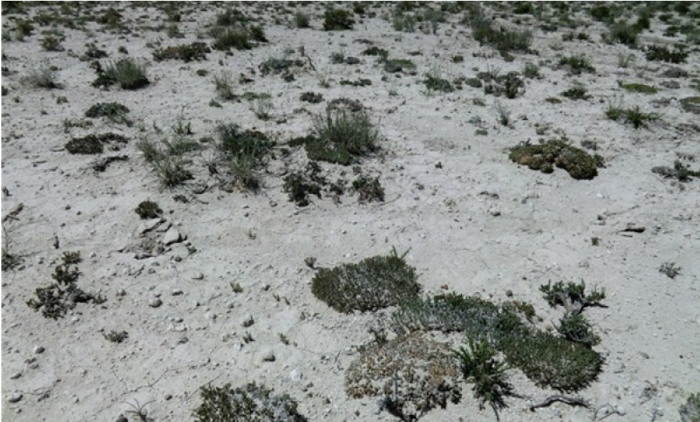
Figure 9. Barren Fan 8-12" (R028BY040NV) P. Novak-Echenique 6/5/2014

This community is dominated by pygmy sagebrush. Perennial bunchgrasses such as Indian ricegrass and needleandthread are decreased. Rabbitbrush may increase.