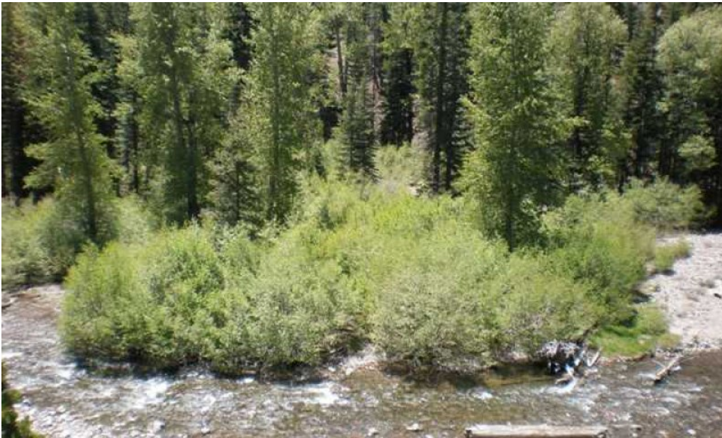
Figure 6. Gravelly Flood Plains

The composition of the plant communities has shifted primarily, because the stream channel incised through deposits creating a terrace with an upland plant community (PCC4). The riparian communities are confined to a smaller area within the new floodplain. In some areas, the sedges associated with the Lemmon's willow- thinleaf alder community (PCC2) have been replaced by grasses because of lower water tables. Non-native species may be present. PCC1b: 20 % Thinleaf Alder- Willow Community This community is found along the stream channel on the banks and relatively stable point bars. Thinleaf alder ( Alnus incana ssp. tenuifolia ) dominates this community with Lemmon's willow ( Salix lemmonii ), and shining willow ( Salix lucida ) present in smaller amounts. Within the patches of shrubs the canopy cover is dense with little understory. However, along the channel or in canopy openings fringed willowherb ( Epilobium ciliatum ), seep monkeyflower ( Mimulus guttatus ), purple monkeyflower ( Mimulus lewisii ), bugle hedgenettle ( Stachys ajugoides ), American vetch ( Vicia americana ), bluejoint