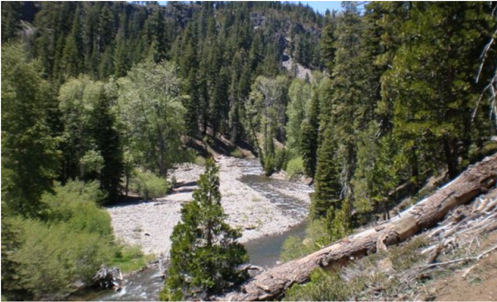
Figure 5. Gravelly Flood Plains, Kings Creek