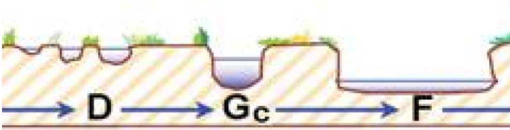
Figure 4. Rosgen Stream Succession Scenario 3