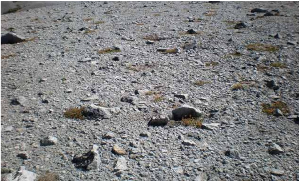
Figure 3. Pyroclastic Flow Ecological Site