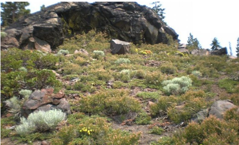
Figure 3. Cryic Pyroclastic Cones

A mixed shrubland with forbs and grasses is the reference community for this ecological site. Trees will not successionaly replace this community due to the characteristics of the