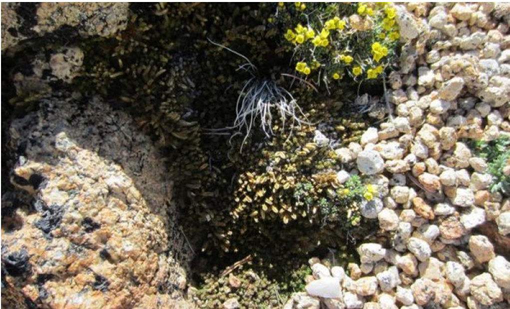
Figure 8. A typical clustering of dwarf alpine plants

Low cover and production of dwarf subshrubs, forbs, and grasses characterize the reference plant community. Subshrubs and forbs average four percent cover, and grasses average two percent cover. Gravels dominate the soil surface, at 45 to 90 percent cover, and larger rock fragments are also abundant, providing up to 50 percent cover. Plant cover is often congested, with multiple species growing together in an interwoven mat due to the facilitating effects of established plants (e.g. Greenlee and Calloway 1996). Species richness in this site is relatively low, with an average of seven species occurring in a given