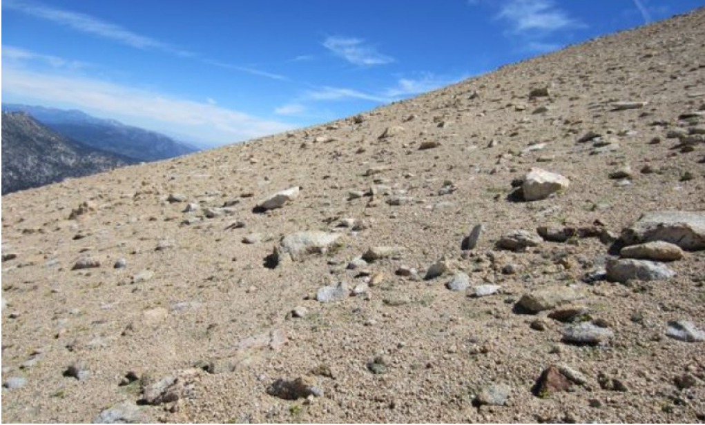
Figure 7. R022AA200CA