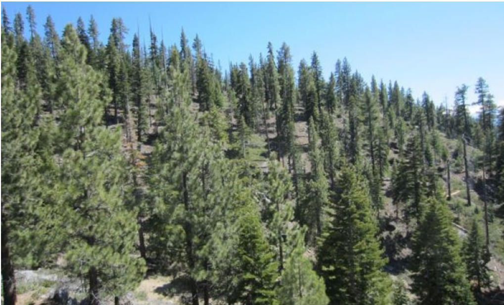
Figure 7. Community Phase 1.3

There are currently some portions of this ecological site that are functioning properly and fit into this plant community phase. However, most of this ecological site has substantial white fir encroachment and is better described in the closed white fir-Jeffrey pine communities. Historically, this community would have developed naturally with frequent surface fires, but manual thinning and prescribed burns now replace the natural fire regime. Manual thinning and prescribed burns remove the white fir component and help maintain the dominance of Jeffrey pine. The removal of the understory trees creates a more open forest structure that reduces the competition between trees and lowers the potential for severe canopy fires.