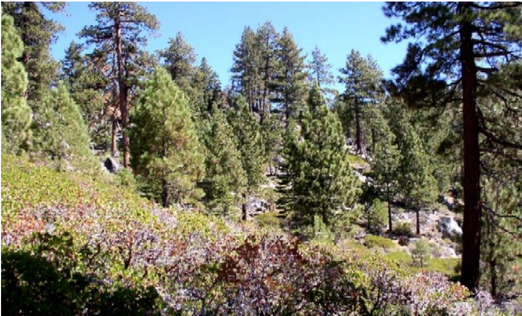
Figure 7. Secondary growth open Jeffrey pine forest

This forest community phase is dominated by an even-aged stand of Jeffrey pine ( Pinus jeffreyi ). The trees exceed 125 years in age. Canopy cover ranges from 15 to 35 percent, with an average of 25 percent cover. Greenleaf manzanita Arctostaphylos patula ), antelope bitterbrush ( Purshia tridentata ), mountain whitethorn ( Ceanothus cordulatus ), and prostrate ceanothus ( ceanothus prostrates ) are common species in the understory. The open canopy and diverse understory is maintained by natural fire intervals. The absence of fire would favor mountain big sagebrush ( Artemisia tridentata ssp. vaseyana ) and antelope bitterbrush ( Purshia tridentata ).