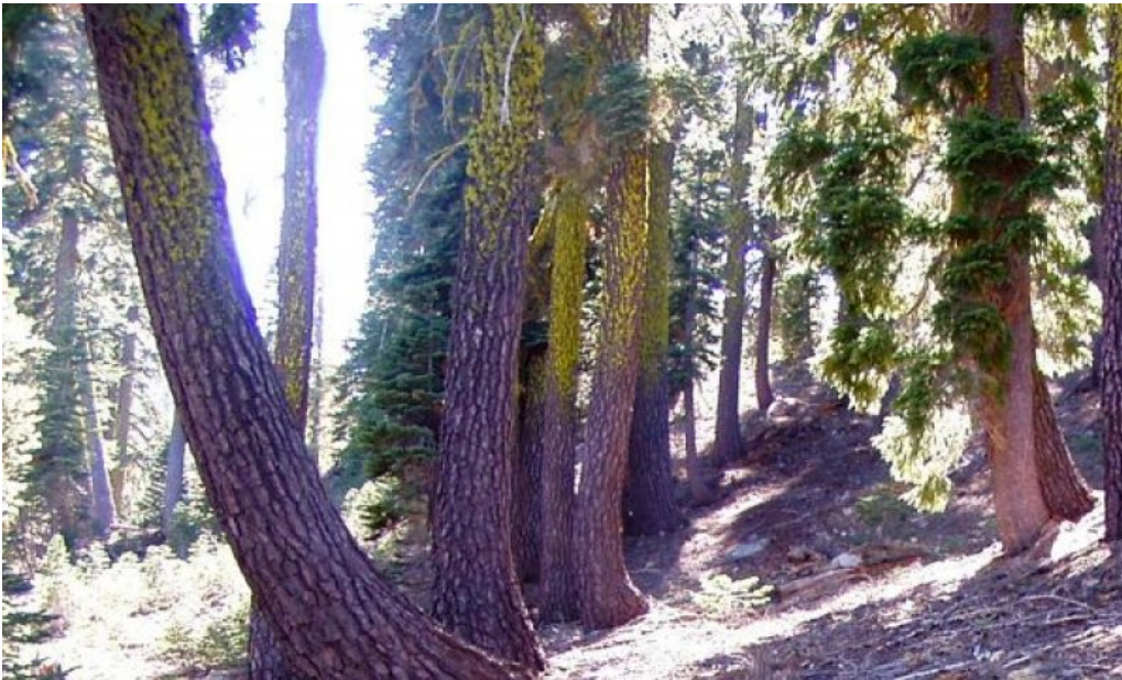
Figure 7. Community Phase 1.3

This forest community phase develops with the natural fire regime, or with manual thinning and prescribed fires. Low to moderate intensity fires clear the understory and remove fuels before they reach hazardous levels. Severe high-intensity canopy fires are also possible and would lead to stand initiation. The density of California red fir and white fir was historically maintained with re-occurring fires every 3 to 37 years that would burn at low to moderate intensity (Bekker and Tayler 2001). California red fir and white fir are shade tolerant and continue to regenerate under the multi-layered canopy. These young trees and seedlings have a high mortality rate even after low intensity fires, which help maintain the open canopy.