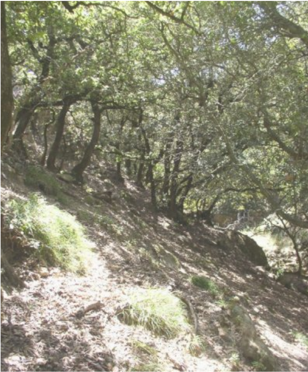
Figure 4. Shrub oak Woodland

This state is similar to the reference state, PC 1.1 and is still dominated by Channel Island scrub oak ( Quercus pacifica ) and Santa Cruz Island manzanita ( Arctostaphylos insularis ). However, it is now intermixed with a non-native annual grassland understory, which is common throughout California. The primary invading species are slender oat ( Avena barbata ), wild oat ( Avena fatua ), ripgut grass ( Bromus diandrus ), soft brome ( Bromus hordeaceus ), and Spanish brome ( Bromus madritensis ). Community Pathway 2.1a: The shift from PC 2.1 to PC 2.2 occurs under a fire regime of approximately 70 to 200 years, with lightning being the primary ignition source. Fires have generally increased to 40 to 50 years due to an increase in human-caused fires since the arrival of European settlers. Fires result in a decrease in shrub cover and an increase in the non-native understories dominated by non-native annual grasses. Community Pathway 2.1b: The shift from PC 2.1 to PC 2.3 occurs if fires become more frequent (less than 10 year intervals). Grazing by livestock and non-native wildlife can also push PC 2.1 towards PC 2.3.