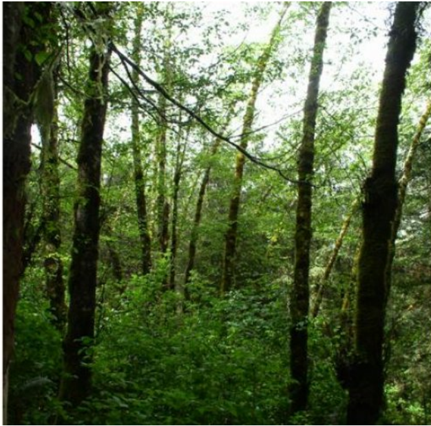
Figure 7. Alder-salmonberry

Red alder, salmonberry, and western swordfern may rapidly invade a site after a disturbance. Redwood-sorrel may also increase in cover. The estimated tree age for this plant community ranges from 0 to 5 years. Community Pathway 2.1: This community will transition to PC 1.3 as redwood sprouts slowly grow in height to become part of the canopy along with red alder.