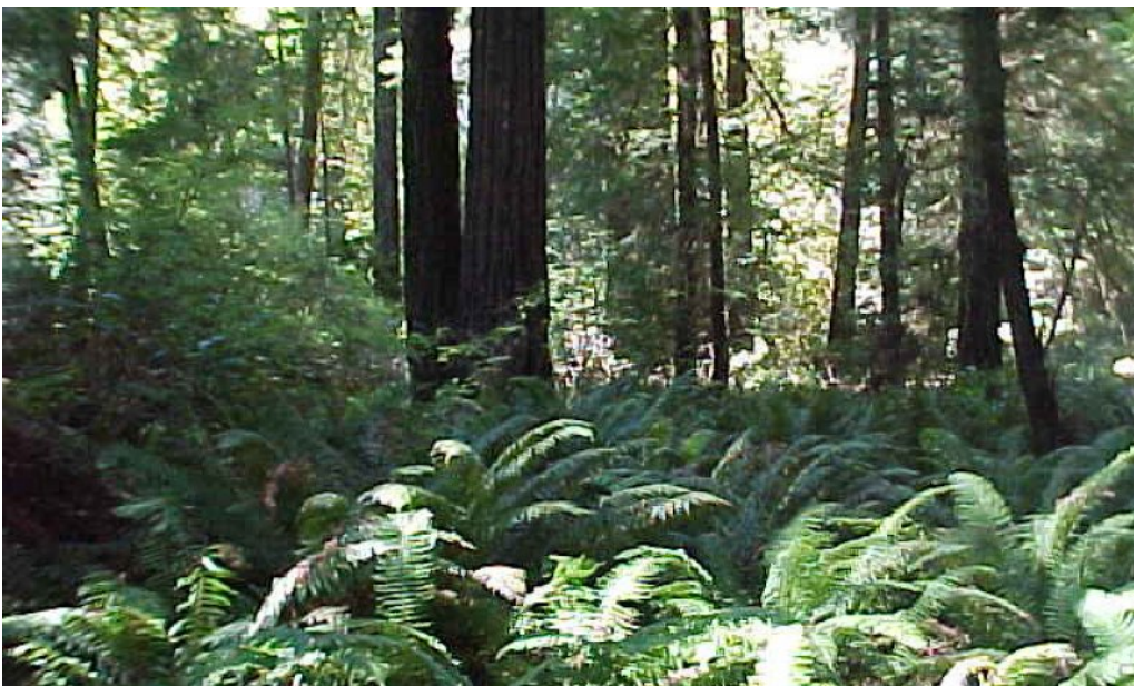
Figure 8. sese

The overstory of the interpretive plant community for this site is dominated by redwood