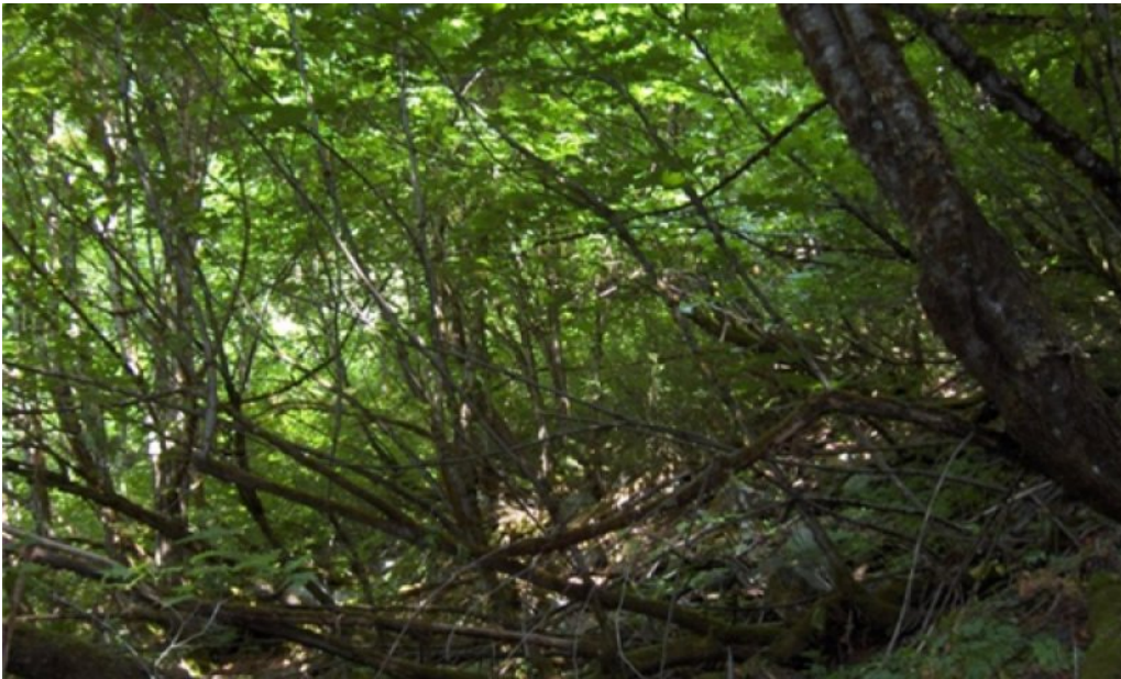
Figure 5. Reference Community

Structure: mosaic of tall shrubs, short shrubs and forbs Vine maple will form large areas of continuous canopy cover especially toward the lower end of avalanche chutes where the slope becomes less steep. These areas tend to have less varied shrub composition but higher amounts of forbs and ferns. Where vine maple becomes more patchy, other tall shrubs such as red elderberry ( Sambucus racemosa ) and redosier dogwood ( Cornus sericea ) and willows ( Salix spp.) can be present. These species don't take on a prostrate form, instead they resprout basally, becoming stunted and multi-stemmed. Prickly currant, red huckleberry, thimbleberry ( Rubus parviflorus ), salmonberry ( Rubus spectabilis ) and Cascade Oregongrape will also take advantage of a more open canopy. All of these species (with the possible exception of prickly currant) can readily sprout from the root crown and are therefore able to persist in avalanche chutes. Understory species included in the Canopy Cover Summary table had at least a 50% rate of constancy in 13 inventory plots.