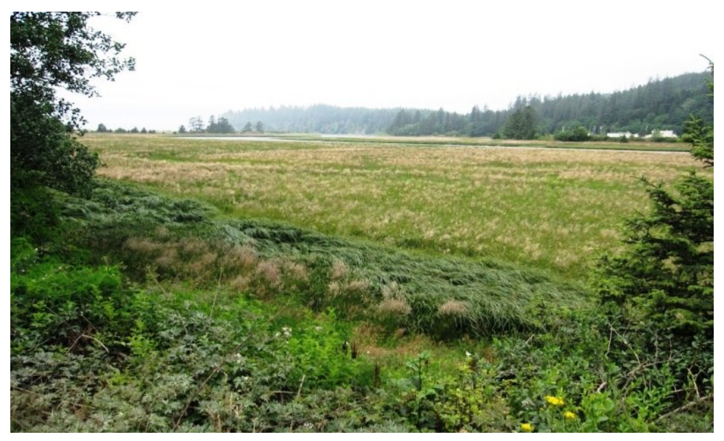
Figure 4. Backshore shrub community view of estuary