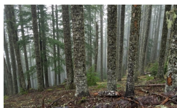
Western Hemlock, Douglas-fir, Cascade Oregongrape, Western Swordfern, and Oregon Oxalis